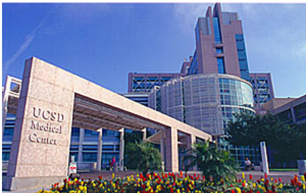
UC San Diego Medical Center has been named one of the nation's 100 Top Hospitals.

The Truven Health 100 Top Hospitals® study evaluates performance in 10 areas: mortality; medical complications; patient safety; average patient stay; expenses; profitability; patient satisfaction; adherence to clinical standards of care; post-discharge mortality; and readmission rates for acute myocardial infarction, heart failure, and pneumonia. The study is celebrating its 20 th year, and has been conducted annually since 1993.