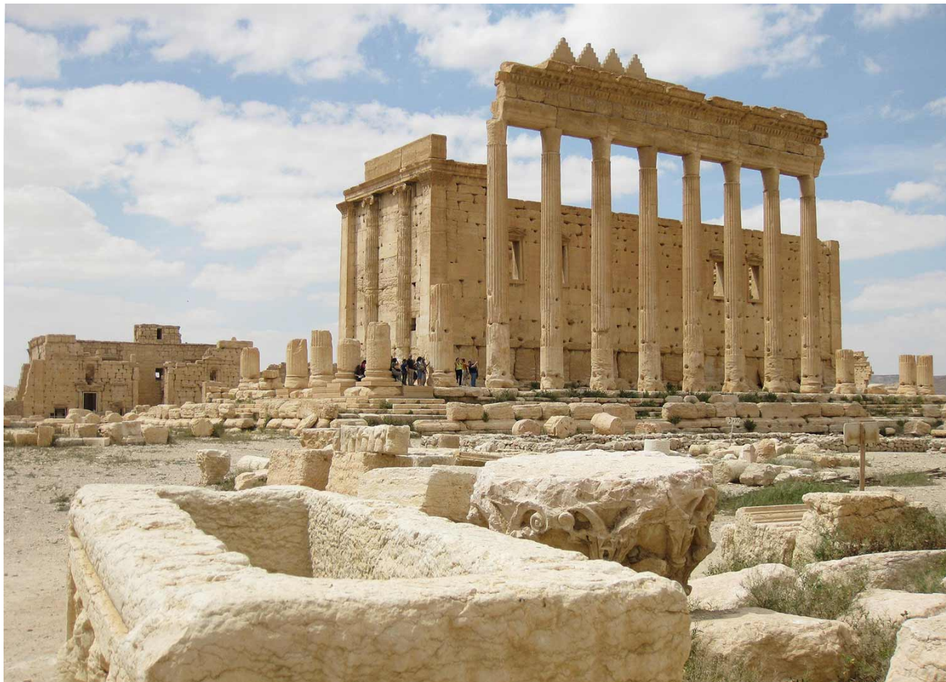
Temple of Bel in Palmyra, Syria.