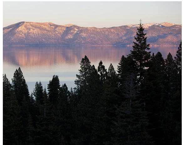
A mountainous view of Lake Tahoe.