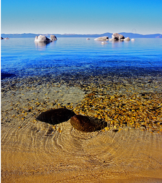
Shore of Lake Tahoe and its blue water.