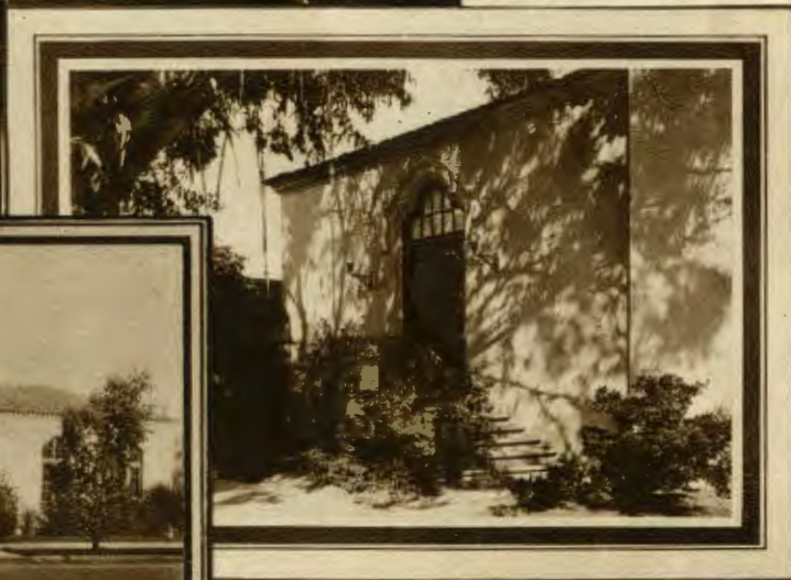
LA JOLLA California