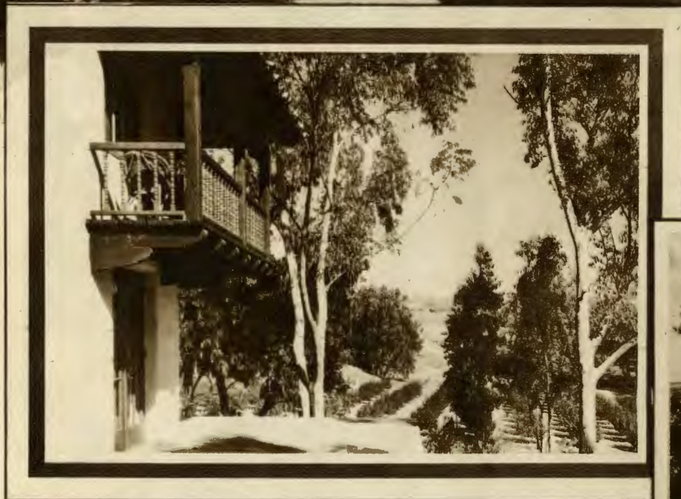
TORREY PINES PARK