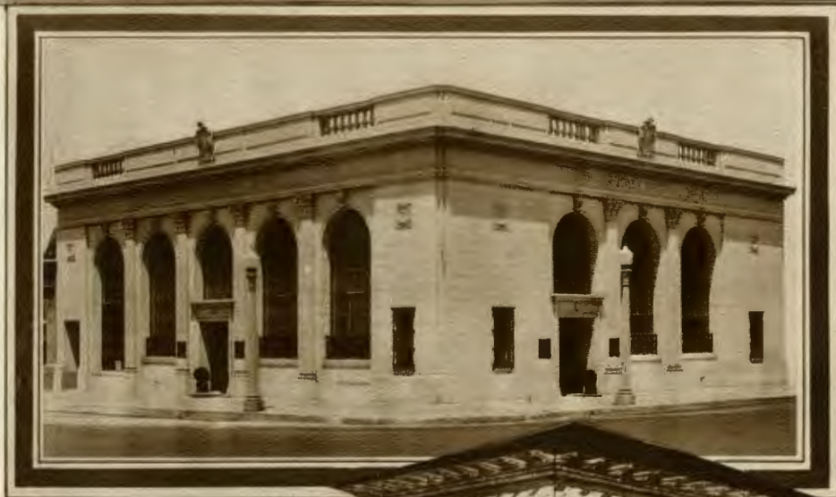
LA JOLLA NATIONAL BANK