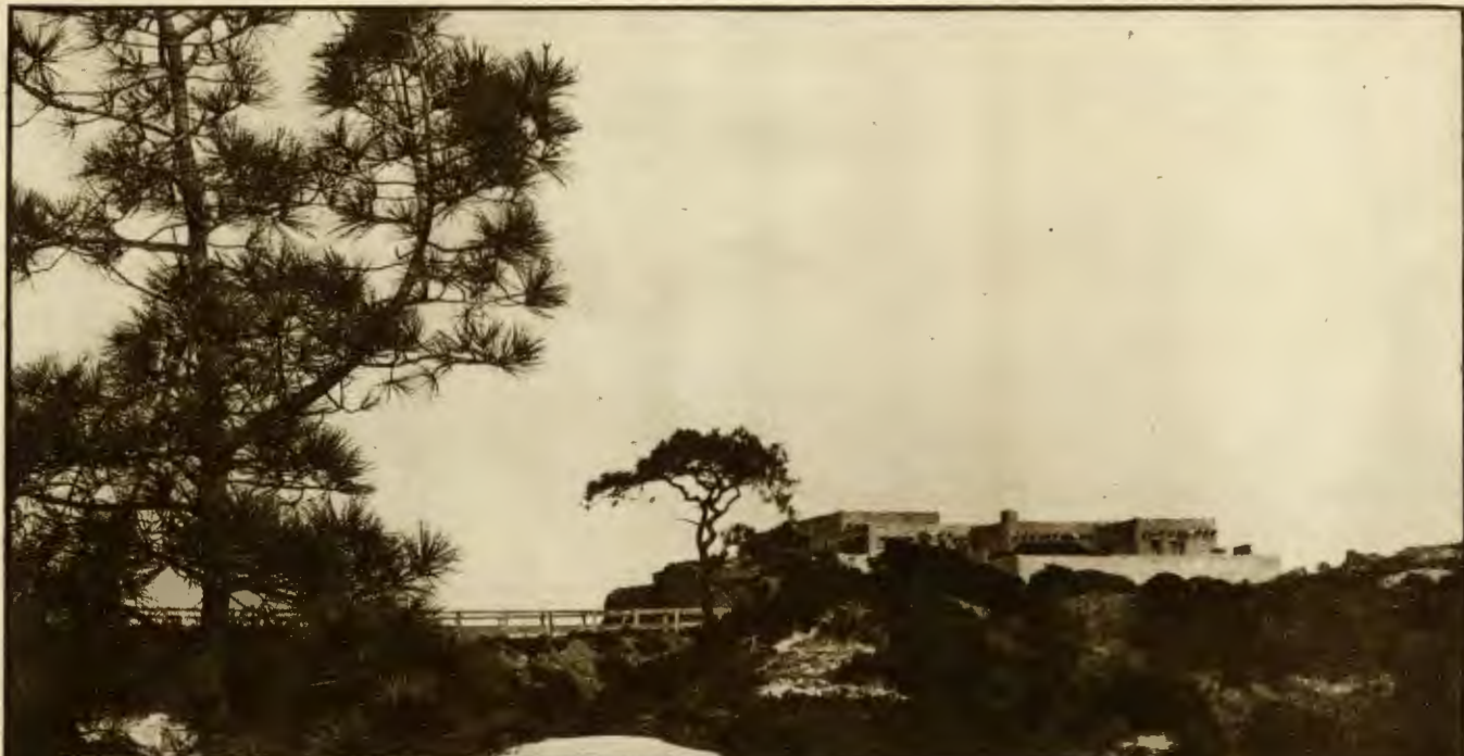
TORREY PINES LODGE