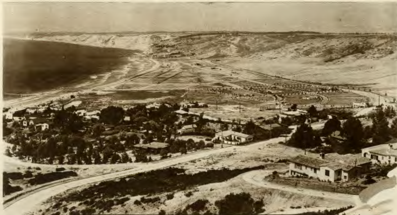
LA JOLLA SHORES DEVELOPMENT AND LA JOLLA VISTA WITH FAMOUS CLIFFS BEYOND