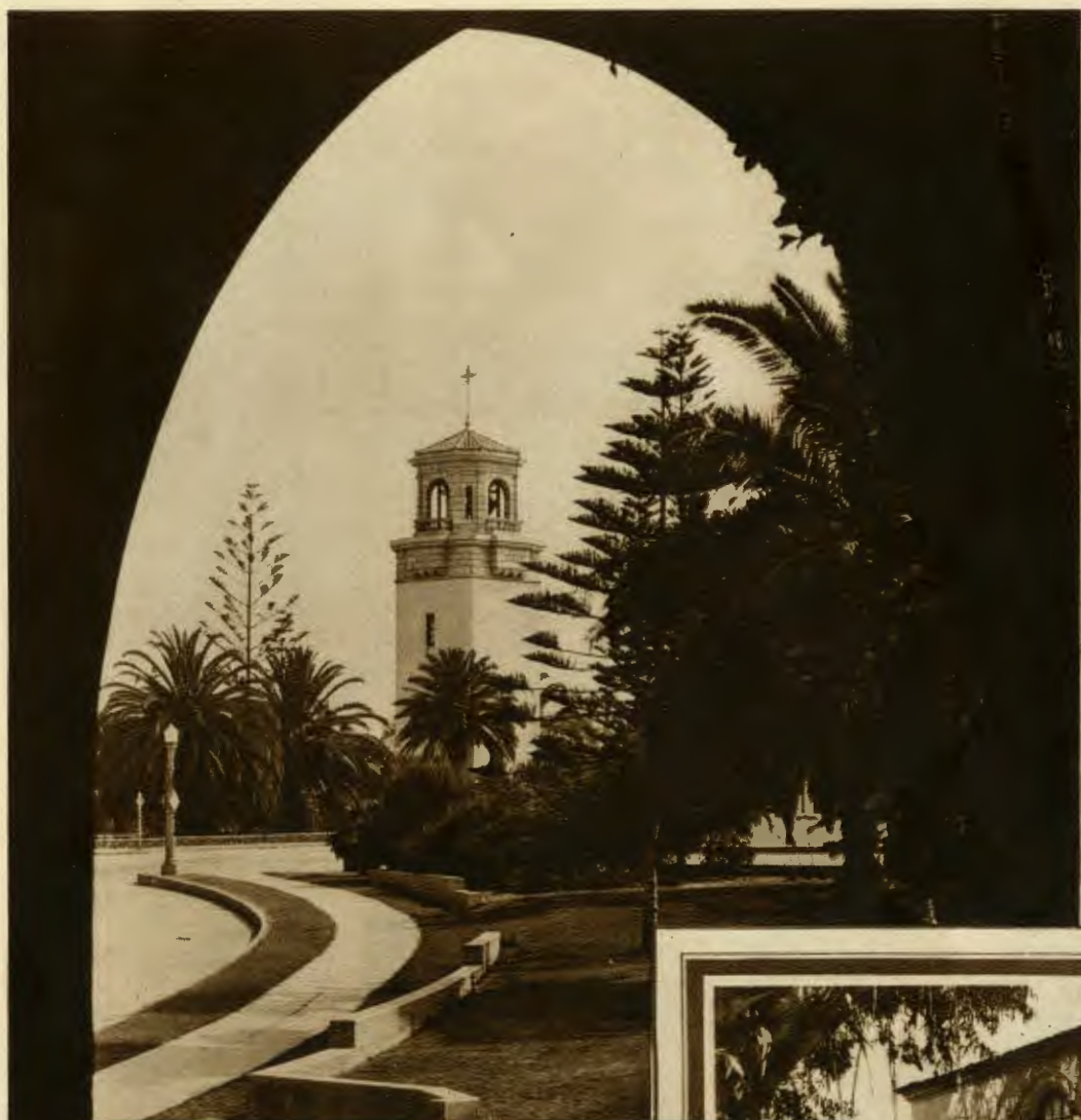
ST. JAMES BY-THE-SEA