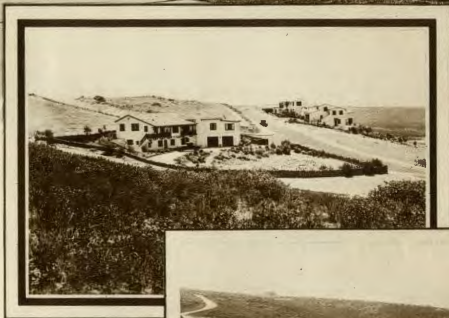
COUNTRY CLUB HEIGHTS