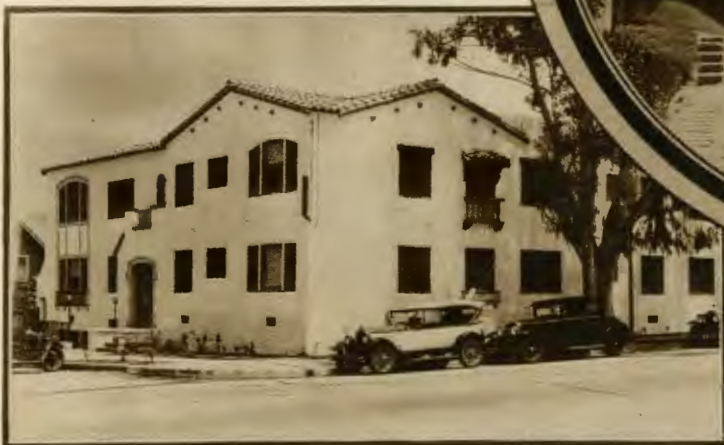
LA JOLLA MANOR