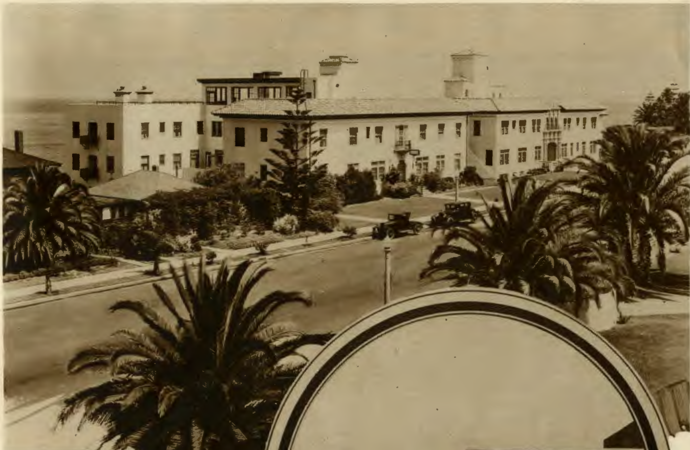
SCRIPPS MEMORIAL HOSPITAL AND METABOLIC CLINIC