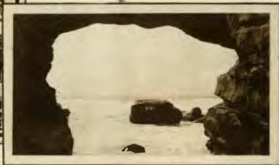
GLIMPSES OF THE SEA THROUGH WINDING LANES AND FROM ROCKY SHORE