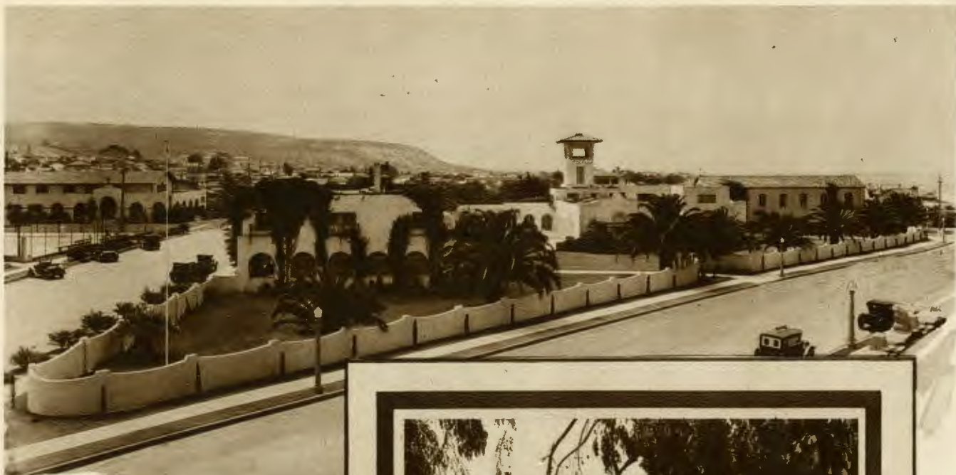
BISHOP'S SCHOOL FOR GIRLS