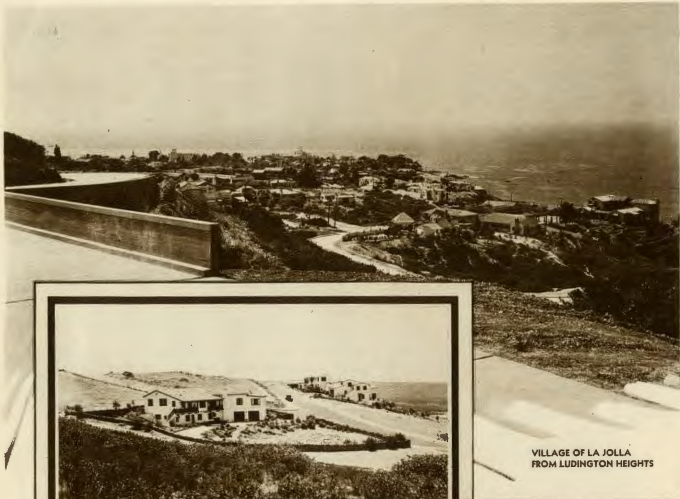
VILLAGE OF LA JOLLA FROM LUDINGTON HEIGHTS