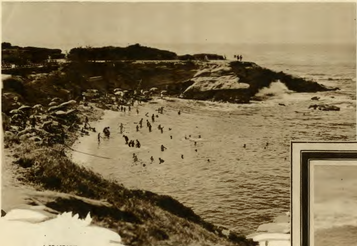
A COAST LINE OF OLD WORLD CHARM