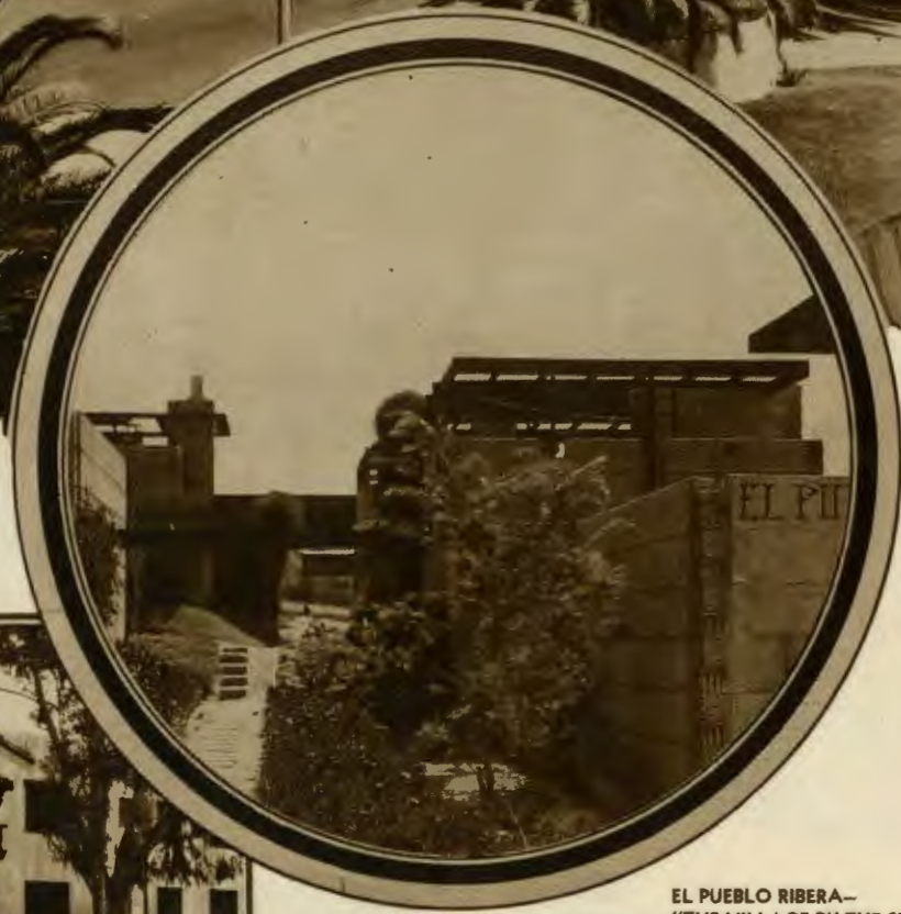
EL PUEBLO RIBERA— "THE VILLAGE BY THE SEA"