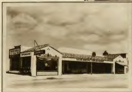
DISTINCTIVE TYPES OF ARCHITECTURE IN BUSINESS CENTER