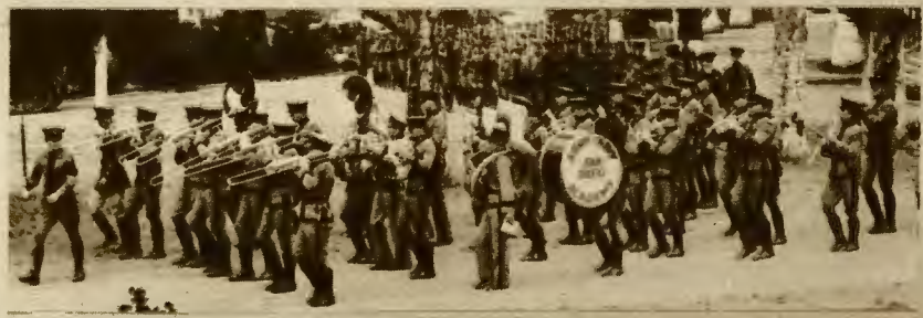
CADETS OF SAN DIEGO ARMY AND NAVY ACADEMY