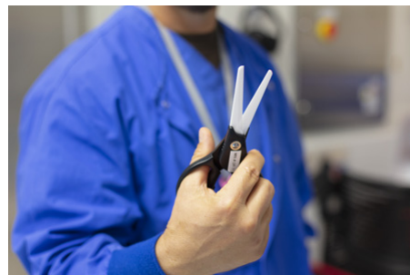
Because the MRI uses a large and powerful magnet, all surgical room supplies must be made from magnet-safe materials, such as these plastic scissors.