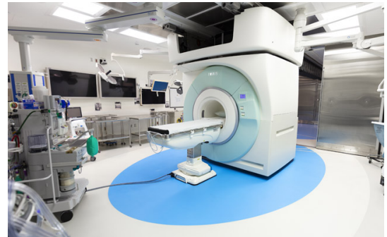
Doctors can roll an MRI machine suspended by ceiling tracks from its “garage,” located behind the stainless steel doors, into one of two intra-operative surgical suites during a procedure to perform scans without moving the patient.

“This changes the way we are able to perform neurosurgery,” said Alexander Khalessi, MD, chair of neurosurgery at UC San Diego Health. “These suites put the surgeon in the strongest position possible to offer patients a safe technical result for complex tumors or vascular problems in the brain. They provide real-time images for deep brain applications, such as laser ablation, that cannot be safely performed any other way.”