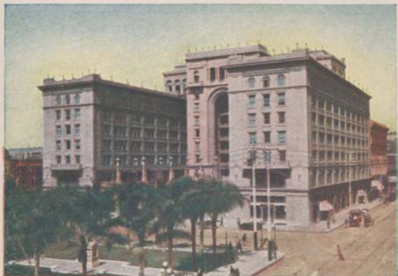
U. S. Grant Hotel