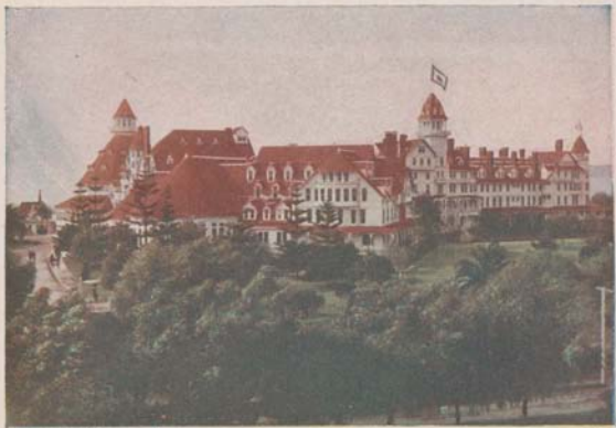
Hotel del Coronado