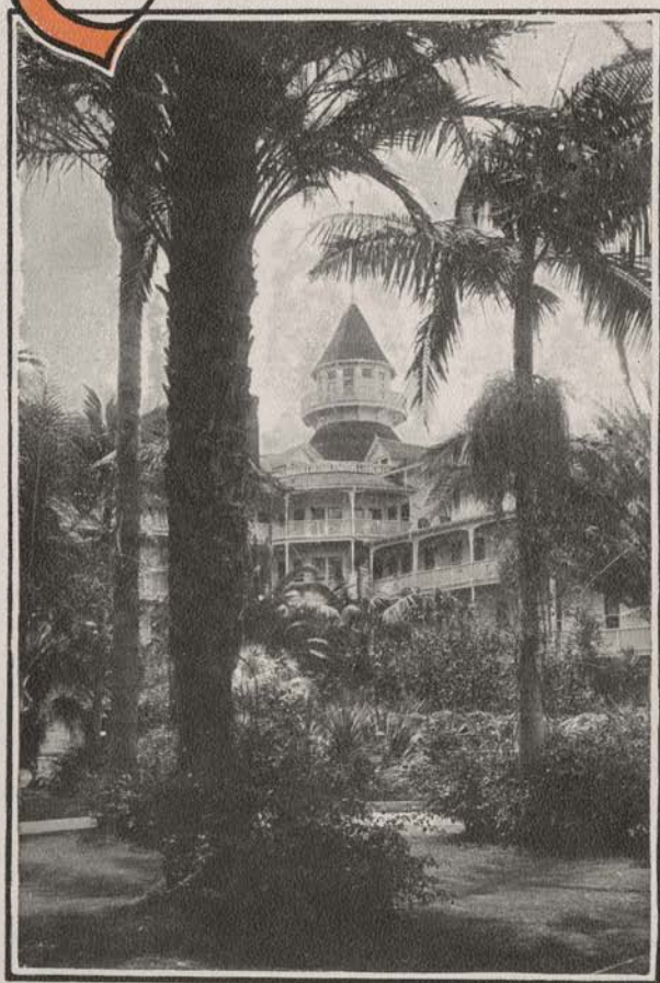
THE PATIO INSIDE THE HOTEL