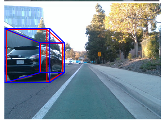
Multi-radar system predicting the dimensions of cars in live traffic. Red boxes are the predictions, blue boxes are the ground truth measurements.

vantage points with an overlapping field of view, we create a region of high-resolution, with a high probability of detecting the objects that are present," Bansal said.