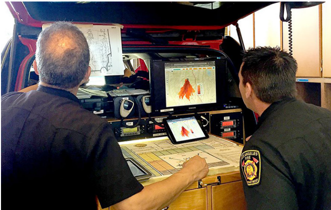
Los Angeles Fire Department personnel use Firemap, a web-based tool developed by UC San Diego researchers, to perform data-driven predictive modeling and analyses of wildfires.

Real-Time 'Firemap' tool proves effective in recent Los Angeles-area blazes