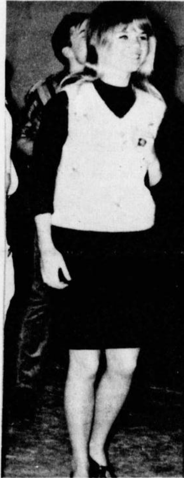
BOYS, have you seen this girl around campus? Try the AMS-AWS Dance Saturday!