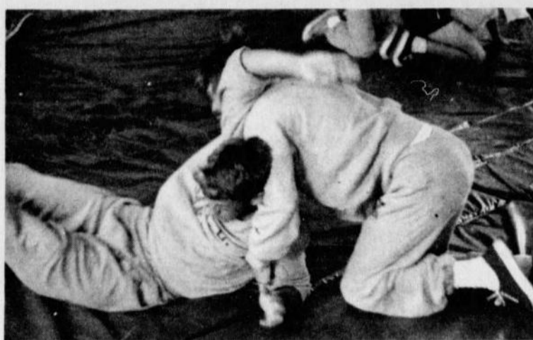
UCSD grapplers are preparing for the intramural wrestling tournament to be held Jan. 6 and 7.