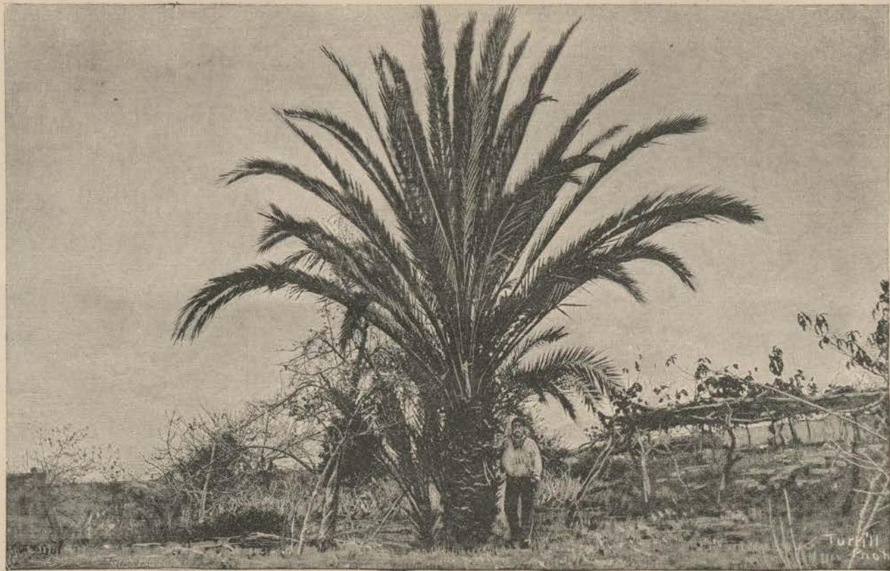
DATE PALM NEAR ENSENADA.