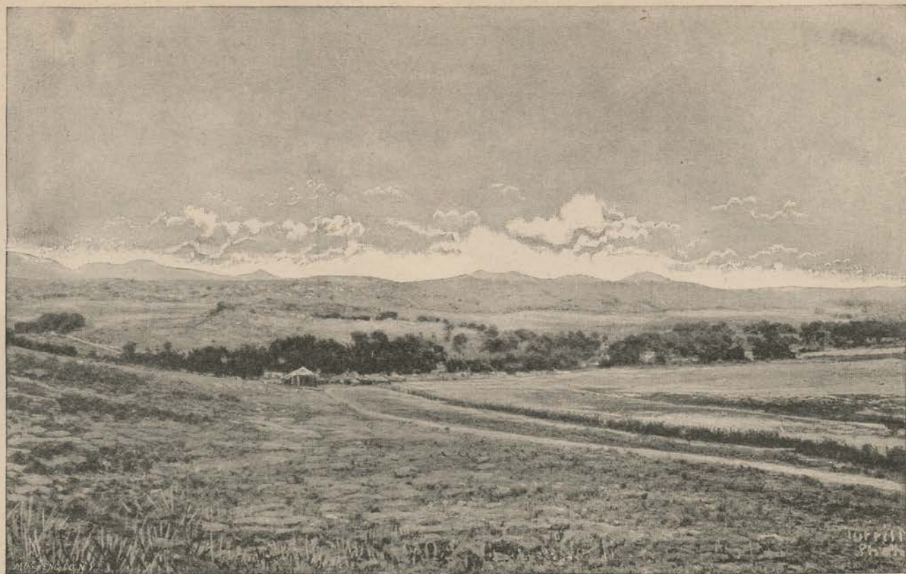
UPLANDS ON PENINSULA.