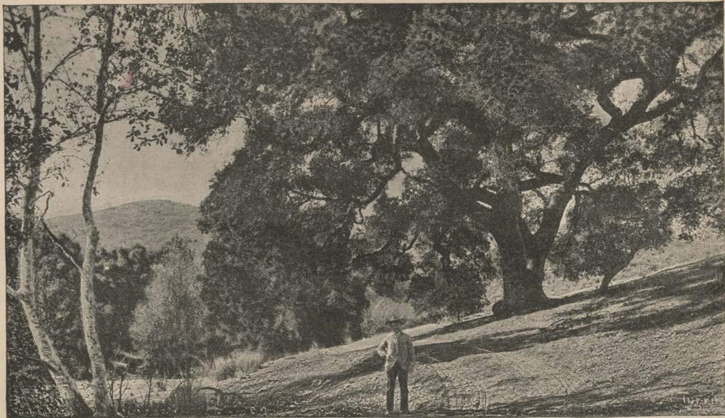
LIVE OAKS, AND VALLEY SLOPE, ON THE PENINSULA.