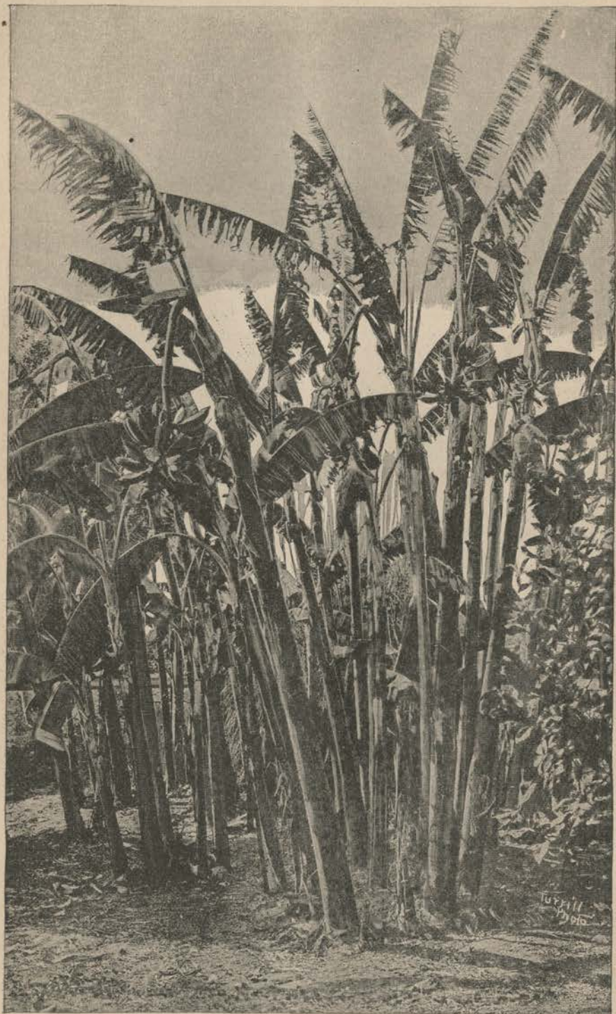
BANANA PLANTS IN DECEMBER, NEAR ENSENADA.