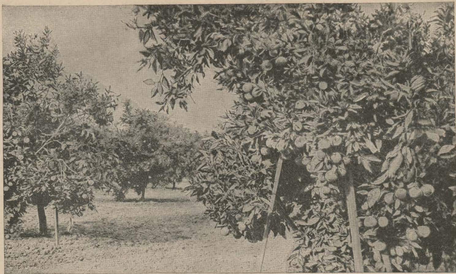
ORANGE GROVE A FEW YEARS OLD.