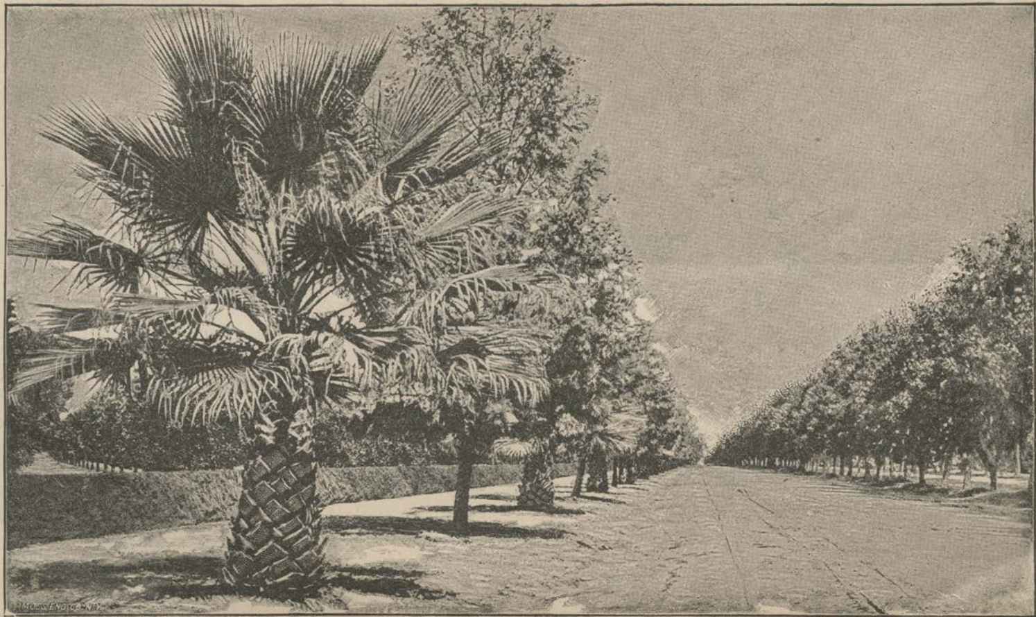
FIVE YEARS AGO A GRAIN FIELD.