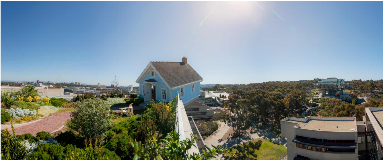
Fallen Star, 2012. Do Ho Suh. Stuart Collection, UC San Diego.