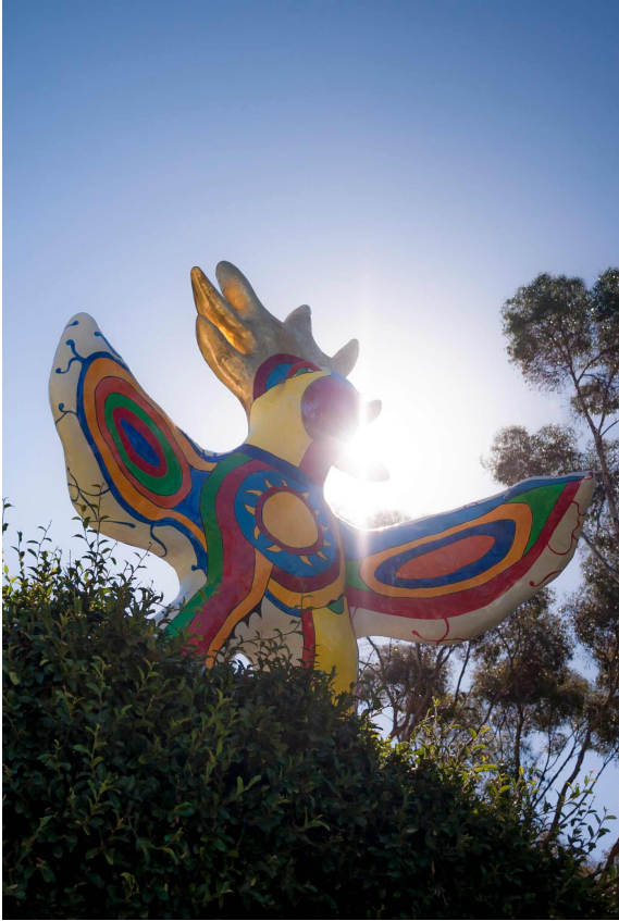
Sun God, 1983. Niki de Saint Phalle. Stuart Collection, UC San Diego.

endeavor is the Friends of the Stuart Collection, a network of 130 arts enthusiasts who help fund new projects.