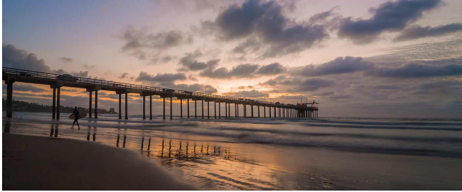
Scripps Pier at sunset

Her generous support also funds the lead gift of $500,000 for a $2 million endowed postdoctoral fellowship and the lead gift of $500,000 for a $1 million graduate fellowship at Scripps Oceanography.