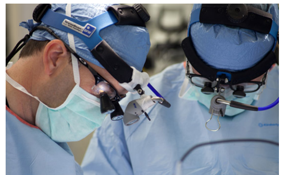
More than 30 neurosurgeons at UC San Diego Health System are dedicated to the care of complex neurological diseases.

According to the Becker’s Hospital Review editorial team, these hospitals offer outstanding spine and neurosurgical care, and were selected based on nominations, clinical accolades, quality care and other spine and neurosurgical proficiencies.