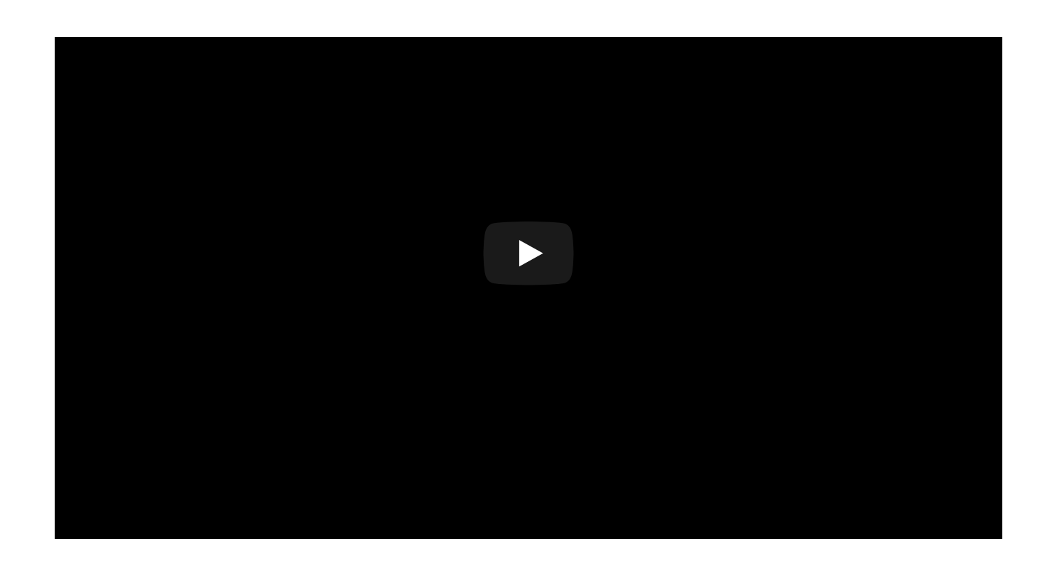
Keep up with campus news by subscribing to This Week @ UC San Diego