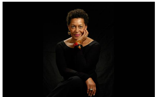
Carrie Mae Weems will speak at a free, public lecture on Nov. 7.