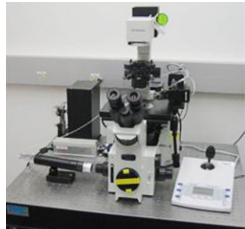
micromanipulation equipment is used to isolate the single cells that will be used for DNA amplification and genomic sequencing.

Researchers sequenced a single cell of E. coli with this method to verify the accuracy of the algorithm and recovered 91 percent of its genes, doing nearly as well as conventional sequencing from cultured cells. This provides enough data to answer many important biological questions, such as what antibiotics a species of bacteria produces. It also, for the first time, enables researchers to perform in-depth studies to figure out which proteins and peptides the bacteria living in human beings use to communicate with each other and with their host.