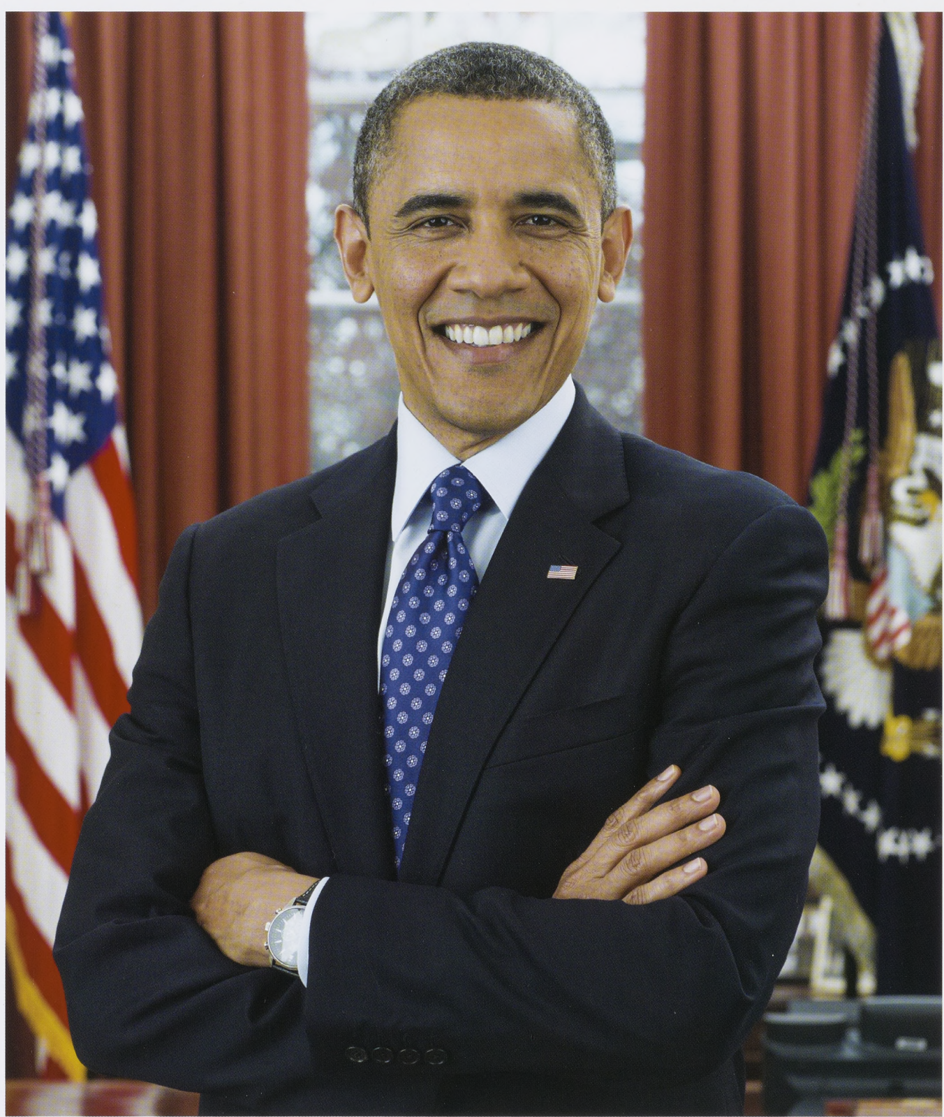
All the best,