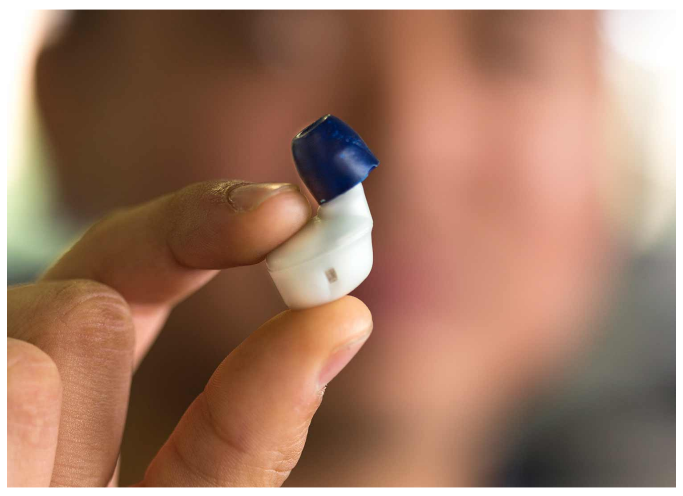
Hush earbuds were designed to block out noise to allow for better sleep, but connect with the user's phone so they can still hear alarms or emergency notifications.