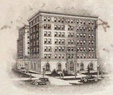
FIREPROOF 225 ROOMS-225 BATHS