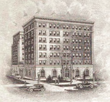
FIREPROOF 225 ROOMS-225 BATHS