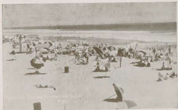
Popular bathing beach fronting the hotel

All the conveniences of a modern city of 5000 population.