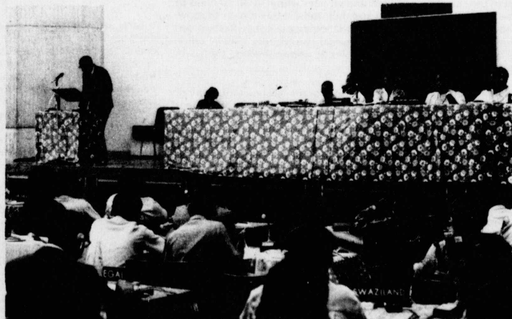
Sixth Pan African Congress

of Pan-Africanism, the liberation of oppressed people. For African people it begins with African people. It begins with a commitment to acquiring knowledge to remove oppression. It begins with receiving and returning a smile to one experiencing oppression. It begins with being involved with the B.S.U., Black Drama, Ujima, Co-op, Com-Student Alliance. It ends with us at the essence of the conflict for that the primary contradiction of common African currency, a reaching the highest levels of our