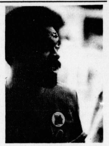
Amiri Baraka Congress of African People

In an attempt to cope with the represent the continents of the increasing chasm among the Third World. Support the struggles of