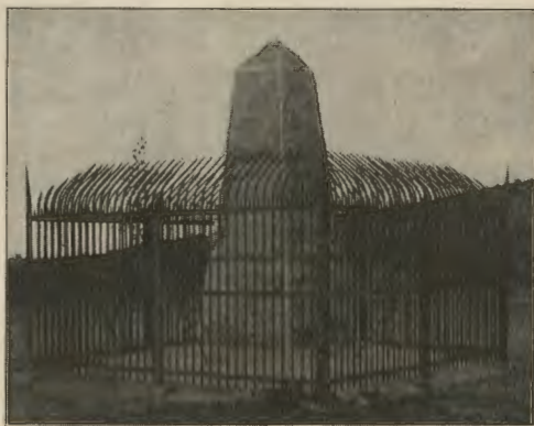
MEXICAN BOUNDARY MONUMENT

One of the interesting excursions is to El Cajon Valley and return. This trip enables the tourist to get an insight into the fruit-raising industry of San Diego County.