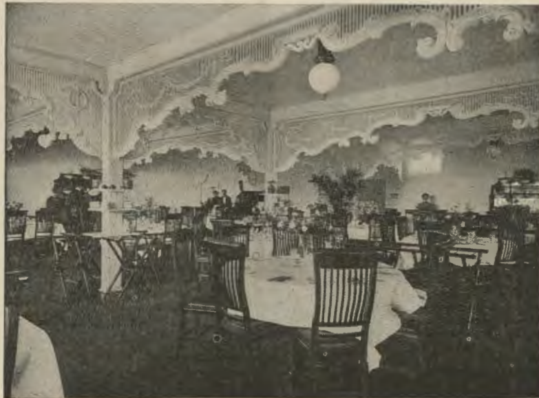
TENT CITY CAFE.

The management of Tent City, realizing that the first need of the tourist is to be well cared for in the way of meals, has made special effort to bring this department to a high standard. When living at this resort guests may be sure that in every instance goods purchased from the concessioners are of the best quality, and that market prices prevail. At the eating houses the charges are, if anything, lower than are found in many large cities.