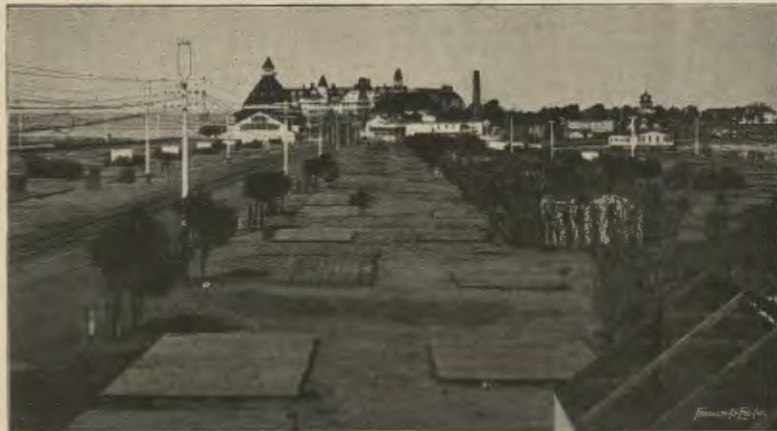
DURING THE WINTER MONTHS.