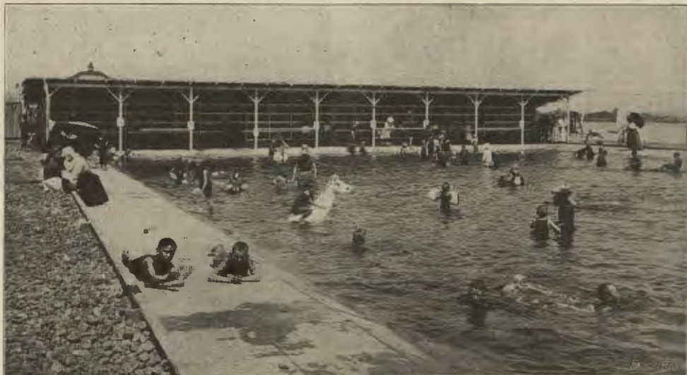
THE NEW CHILDREN'S POOL.