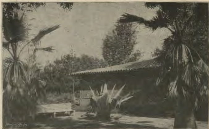
ONE OF THE QUIET SPOTS.