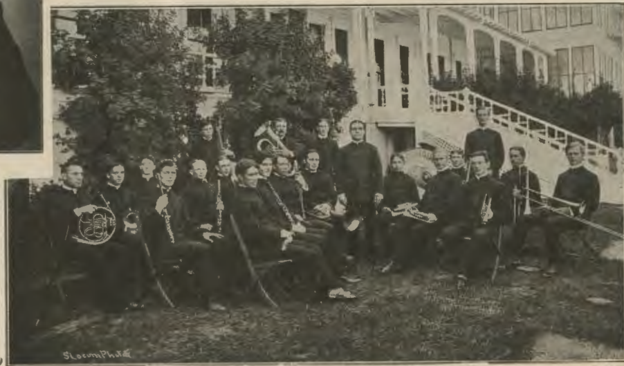
THE CORONADO TENT CITY CONCERT BAND, 1903.

Starting from Albuquerque on May 19, the Coronado Tent City Concert Band will visit the following towns and cities, advertising the merits of the resort: El Paso, Albuquerque, Santa Fe, Phoenix, Prescott, Needles, Fresno, Hanford, Tulare, Visalia, Bakersfield, Redlands, San Bernardino, Corona, Riverside, Ontario, North Pomona, Azusa, Pasadena, Los Angeles, Orange and Santa Ana.