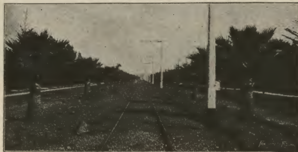
ORANGE AVENUE ELECTRIC CAR LINE.

gage to Tent City, and is good to return any time before October 1st. On arrival at San Diego, board an electric car for the ferry. Arriving there connection is made with the new ferryboat "Ramona," a splendid craft recently built by the Risdon Iron Works, of San Francisco, and crossing the beautiful still waters of San Diego bay, you reach the Coronado side. The popular "double deck" electric car is awaiting passengers there. After a