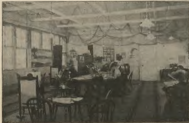
WHERE THE HOME PAPER CAN BE READ.

The reading-room is a general social center; it is the assembly hall of Tent City.