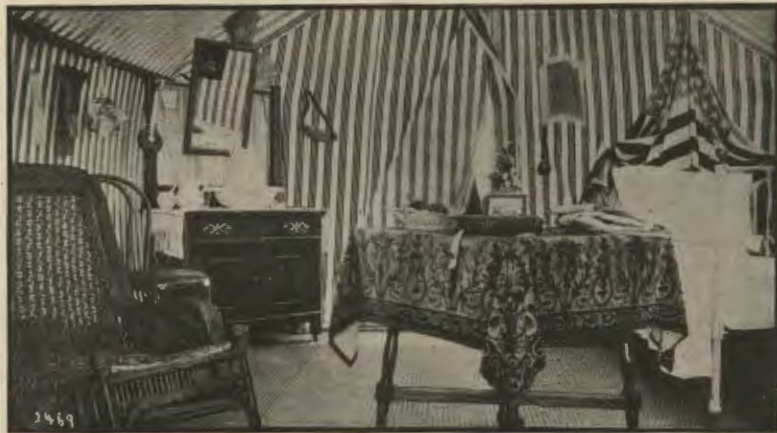
A TENT INTERIOR.