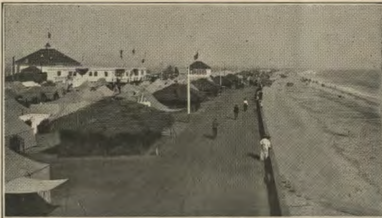
A VARIETY OF RESIDENCES.