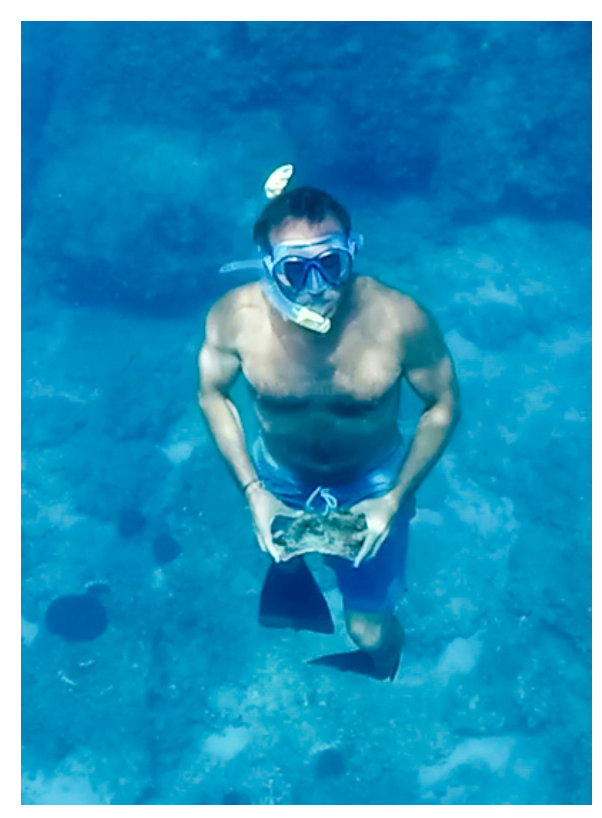
A team member in Greece picking up an amphora, or ancient pottery, fragment.

SCMA envisions serving as the central research hub and institutional platform for students, faculty, and other researchers working on understanding the relationship between people and the sea, as well as climate and environments worldwide. The center plans to share its discoveries through a state-of-theart database and website, publications and peer-reviewed studies, press releases, and possibly through future exhibits at Birch Aquarium at Scripps.