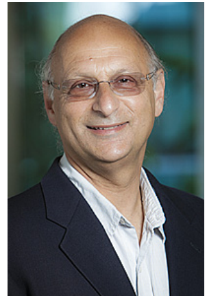
Richard Kolodner, PhD

Established in 1970 by the National Academy of Sciences, the IOM serves as an independent, science-based, authoritative advisory group to the U.S. federal government on diverse subjects ranging from the health effects of salt intake, cancer care and child abuse to mental illness in the military and gun violence.