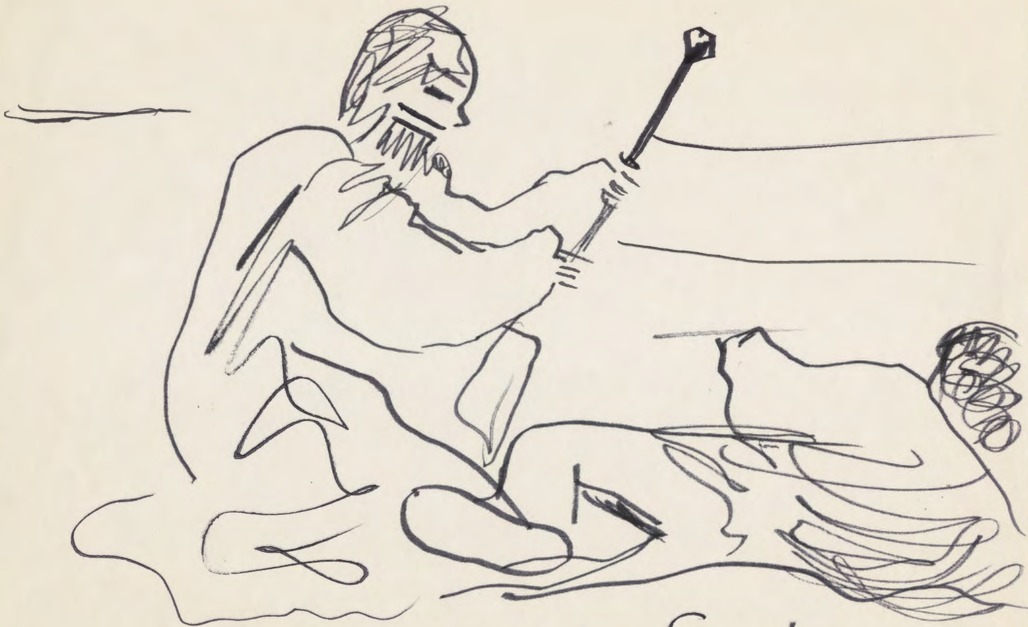
Threatened by Sandpeople