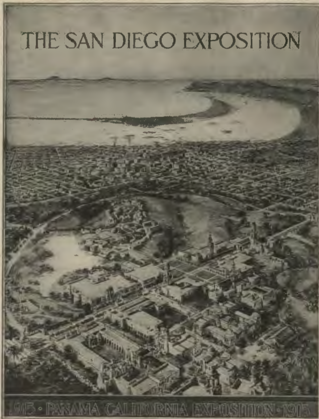
THE EXPOSITION, THE CITY, THE HARBOR AND THE SEA

"When I am dead and in my grave, No more sunshine will I crave; Living, I hope I can and may go To sun myself in San Diego."