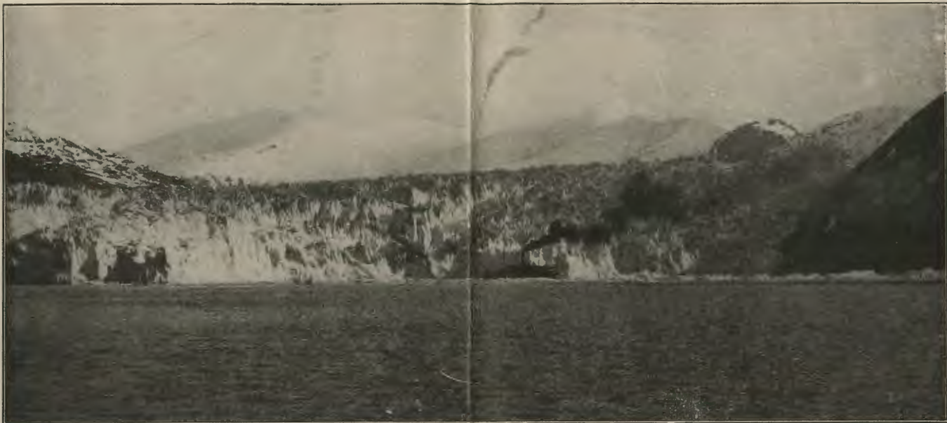
PACIFIC COAST EXCURSION STEAMSHIP AT TAKU GLACIER, ALASKA

Taku Glacier is a moving river of solid ice 200 to 300 feet high, over a mile wide, miles long, and of an intense blue color that no other glacier possesses. Great icebergs break from the front continually. Every cruise and excursion of the Pacific Coast Steamship Company to Alaska visits this glacier.