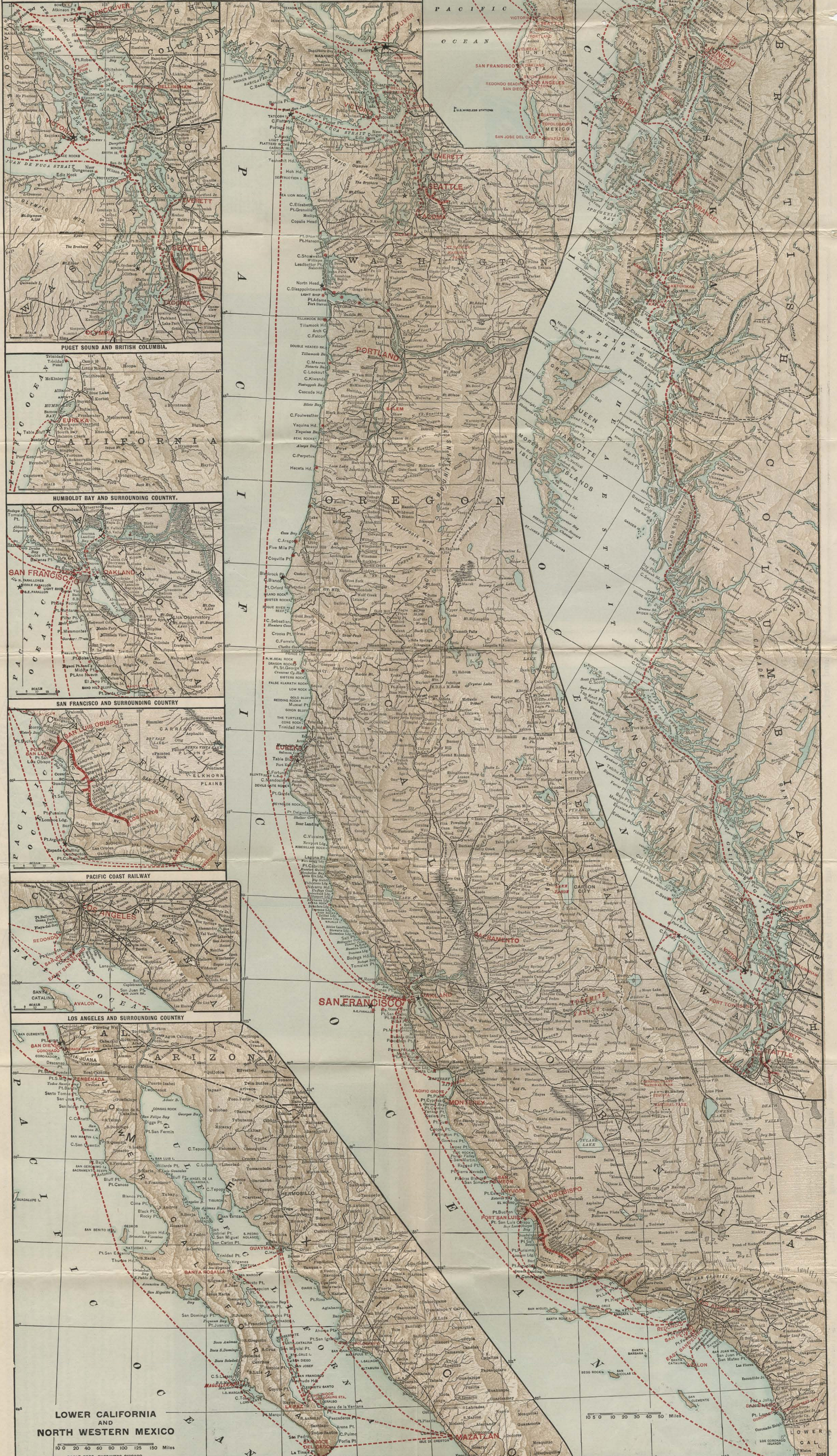
PUGET SOUND AND BRITISH COLUMBIA.