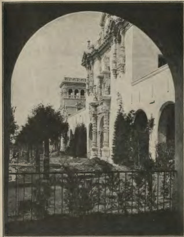
Copyrighted, Panama-California Exposition

The Panama-California Exposition is different from the Panama-Pacific International Exposition. It is unequalled in art, in beauty of surroundings, and in its wonderful climate, the percentage of days of sunshine in San Diego being greater than in any other city in the western United States coast country. And yet for all the sunshine, it is not unduly warm, but, situated beside the sea, enjoys a temperature equalized