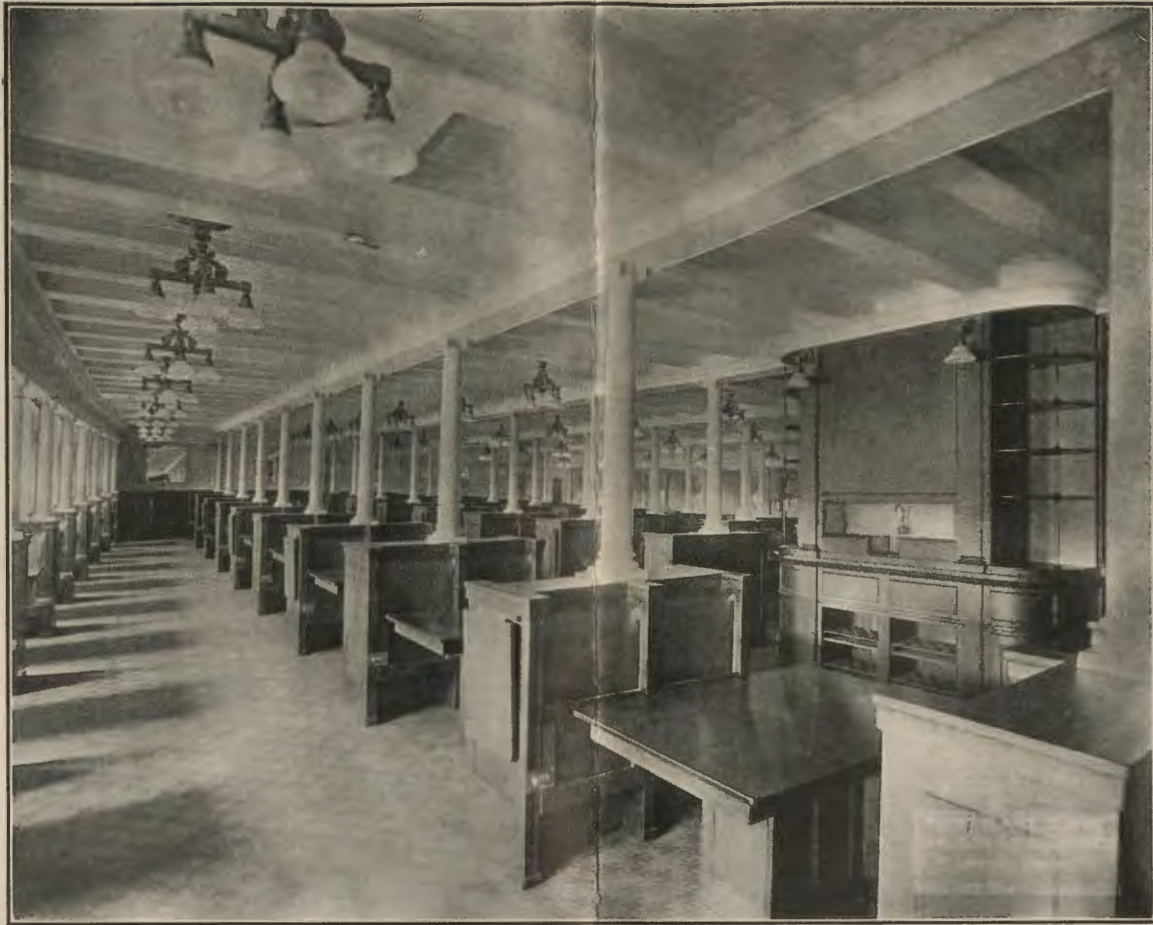
THERE'S ROOM FOR HUNDREDS AT ONE TIME IN THE SPACIOUS DINING SALOON OF THE LUXURIOUS PACIFIC COAST STEAMSHIP "CONGRESS"

Accommodations on steamships "PRESIDENT," "GOVERNOR" and "CONGRESS" are comparable only with the best hotels. Sea travelers holding first cabin tickets are without extra cost provided with a comfortable berth in a first cabin stateroom that is supplied with toilet accommodations, lighted by electricity, and provided with call-bell for service. These cabins are steam-heated on steamers "PRESIDENT" and "GOVERNOR," but heated by electric radiators on steamer "CONGRESS." Travelers also have free use of the large and beautiful social hall, and for men there is a comfortable buffet smoking room. The steamers have well-selected free libraries; by wireless telegraph there is constant possible communication with the world at large; bath-room privi-