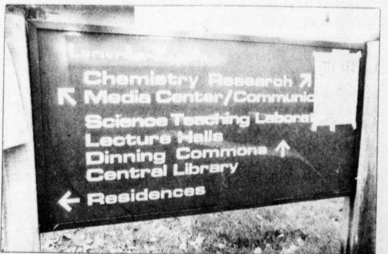
Signs with "Third" spray painted over with "Lumumba-Zapata" appeared across Third's campus last week.