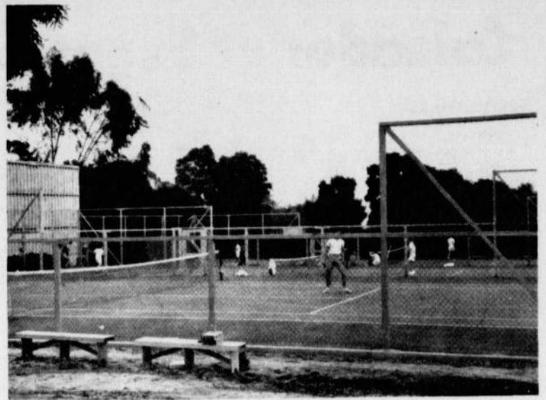
TENNIS PRACTICE on the Camp Matthews tennis courts occurs regularly. Tomorrow at 11 a.m. the UCSD Tritons will meet Riverside in a tennis match on the Camp Matthews courts.