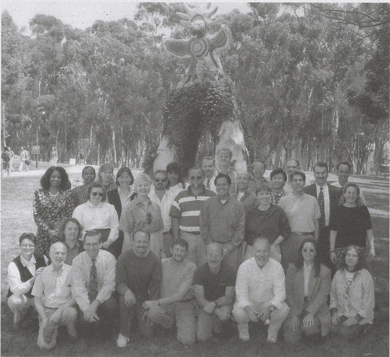
Members of the UCSD Chancellor's Advisory Committee on Lesbian, Gay, Bisexual, and Transgender Issues with their partners, friends, and colleagues from the UCSD student, faculty, and staff community.