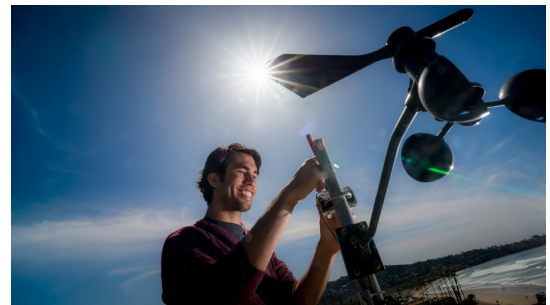
A graduate student checks a weather monitoring station at the Scripps Institution of Oceanography.