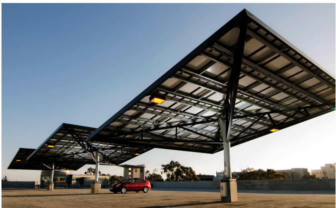
Solar trees on the top floor of the Gilman Parking structure at UC San Diego.

Offering utilities, researchers, industry and other entities a testbed with real-world communications challenges is essential to solve these problems and develop new distributed control theories, algorithms, and applications. The envisioned testbed is built upon a number of technical innovations at UC San Diego that create a microgrid encompassing distributed energy resources, including energy storage, electrical vehicles and independent electrical and thermal systems in buildings. This distributed system is monitored and controlled by computing and networking systems that make it accessible to local and remote researchers as a programmable platform.