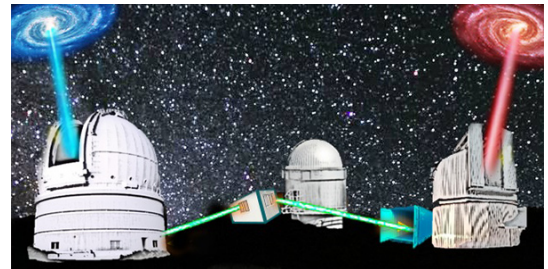
Schematic of the 2018 “Cosmic Bell” experiment at the Roque de Los Muchachos Observatory in the Canary Islands, where two large telescopes observed the fluctuating color of light from distant quasars (red and blue galaxies). The green beams indicate polarization-entangled photons sent through the open air between stations separated by about one kilometer.