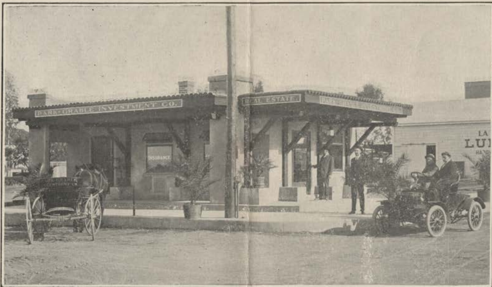
OUR OFFICE AT LA MESA SPRINGS