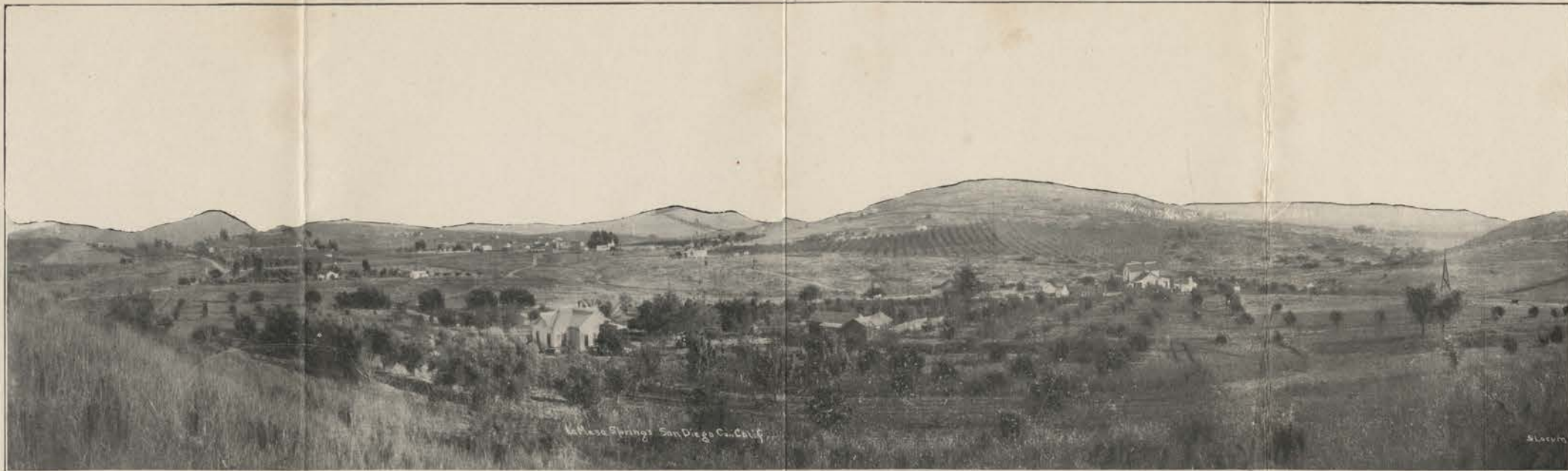
BIRDSEYE VIEW OF LA MESA SPRINGS, OCTOBER, 1907, ELEVEN MILES FROM SAN DIEGO, HIGHEST STATION ON CUYAMACA RAILWAY SYSTEM; TERMINUS BARTLETT WEBSTER FRANCHISE