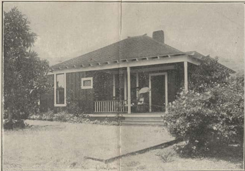
A HOME IN A GARDEN, DATE AVENUE