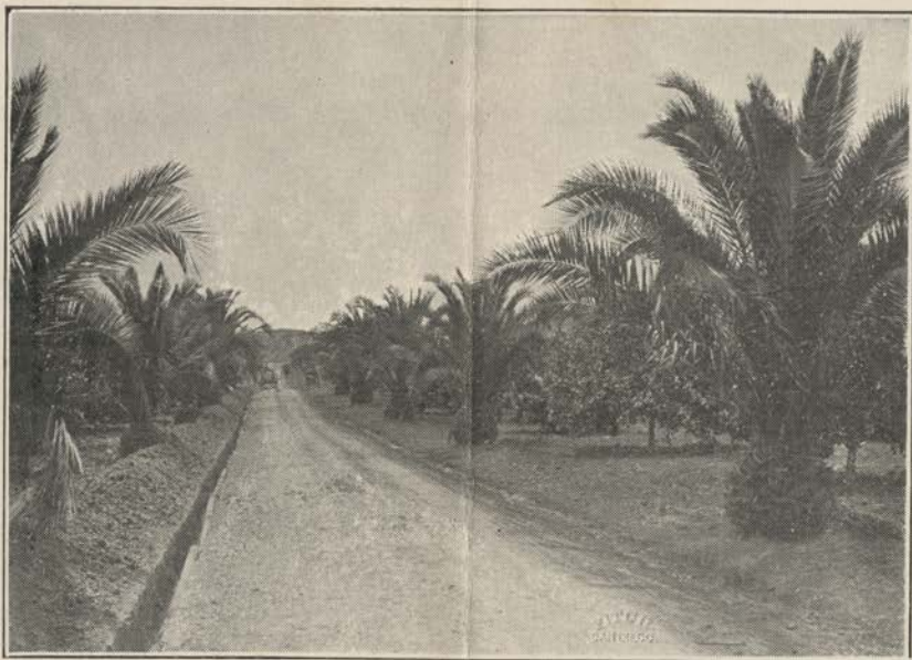
DATE AVENUE, SHOWING EXCAVATION FOR WATER MAIN