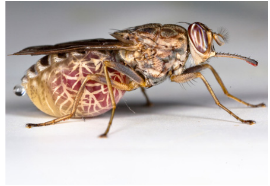
African sleeping sickness (trypanomiasis) is caused by the bite of tsetse flies infected by protozoan parasites belonging to the genus Trypanosoma. Tsetse flies are found only in sub-Saharan Africa; only some species transmit the disease.