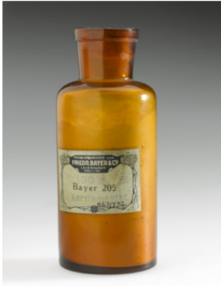
Developed in 1916 by German dye manufacturers Frederick Bayer and Co., Bayer 205 (later renamed suramin) was found to be effective against parasitic trypanosomes responsible for African sleeping sickness (trypanosomiasis). This bottle of suramin powder was given out free of charge for clinical trials of the first production batch.

Unlike treatment for African sleeping sickness, which involves multiple, higher doses of suramin over a period of time and frequently results in a number of adverse side effects ranging from nausea and diarrhea to low blood pressure and kidney problems, researchers said the single, low dose of suramin used in the ASD trial produced no serious side effects beyond a passing skin rash.