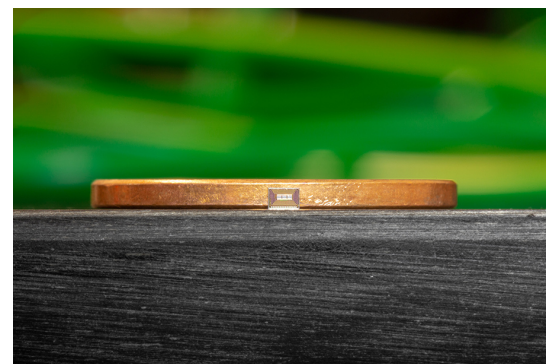
The chip compared to the thickness of a penny