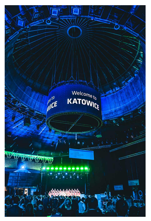
Traditional Polish singers and musicians perform at a COP24 welcome reception in the Spodek arena.