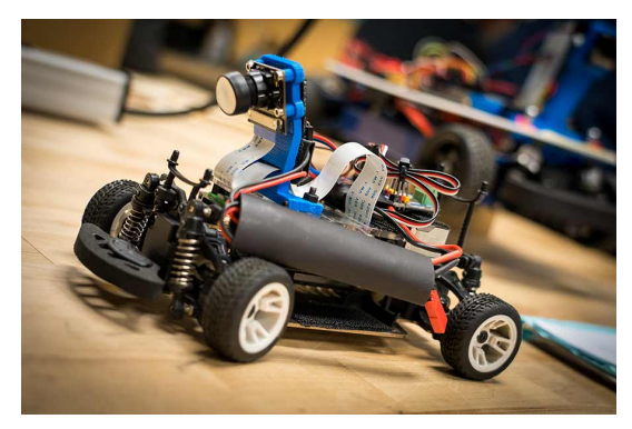
An affordable platform for students to learn the skills required to actually make an autonomous vehicle.

Seeing the results of their efforts was a motivating factor for some students, but many said that the real benefit was the interdisciplinary nature of a hands-on, project-based class like this.