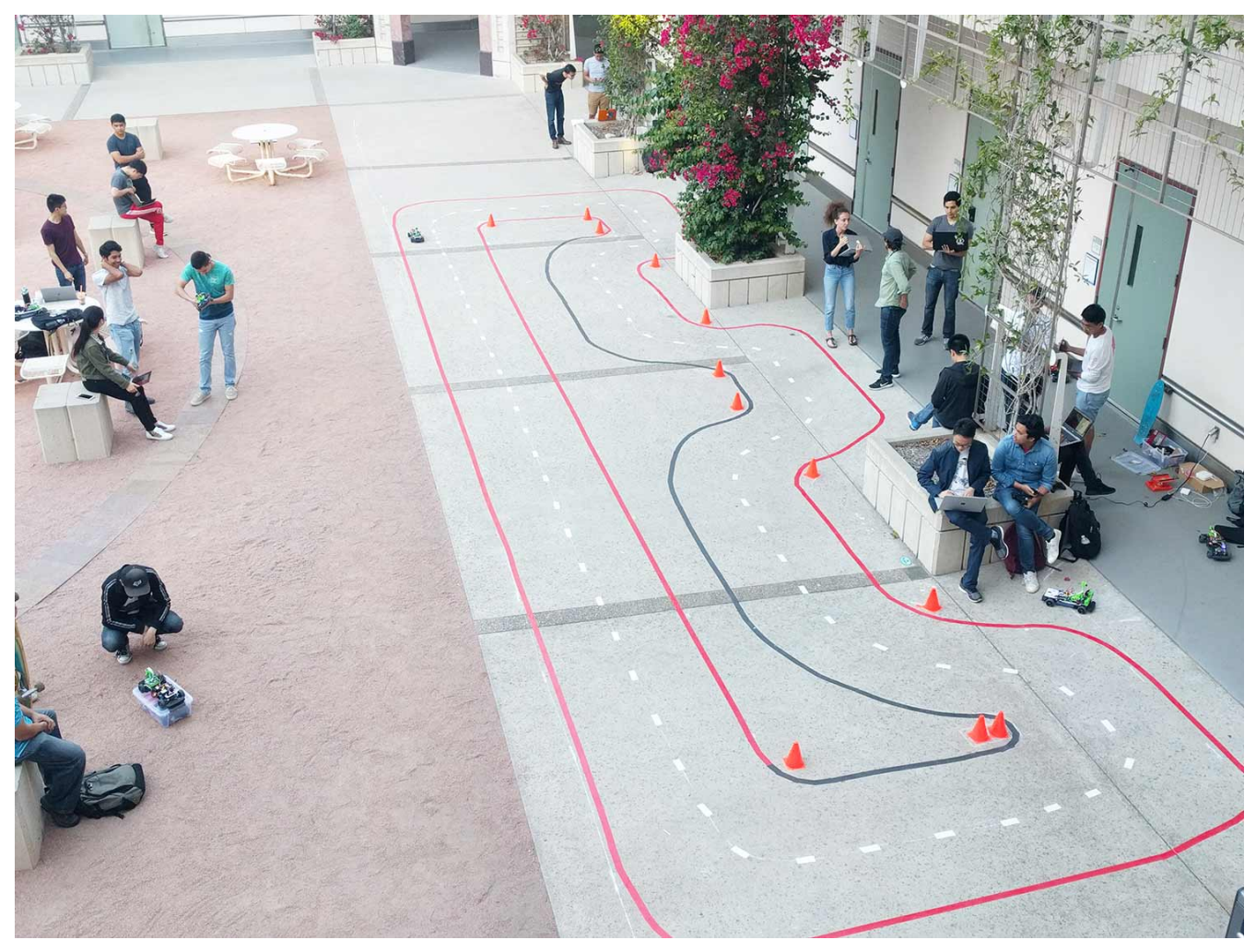
Students test and train their autonomous vehicles on a course they made around the Engineering Building II courtyard.