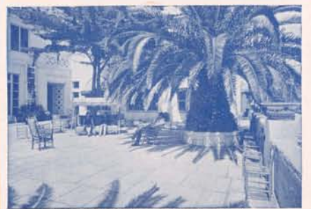
THE PATIO ENTRANCE FROM THE STREET

Sport lovers will find ample opportunity for the enjoyment of their favorite diversion. Golf on the 18 hole, all grass course of La Jolla Country Club, several beaches inviting the bather, fine tennis courts municipally operated, riding stables with fine horses and miles of excellent trails developed by the La Jolla Bridle Trails Association, deep sea fishing, hiking and driving are included in the wide array of outdoor recreations which are available to La Jolla visitors.