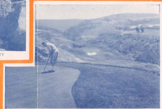
ONE OF THE PERFECT GREENS OF THE SCENIC GOLF COURSE

L A JOLLA, (La Hoya), is 14 miles north of San Diego on the ocean. It has been termed one of the three most beautiful villages in the world.