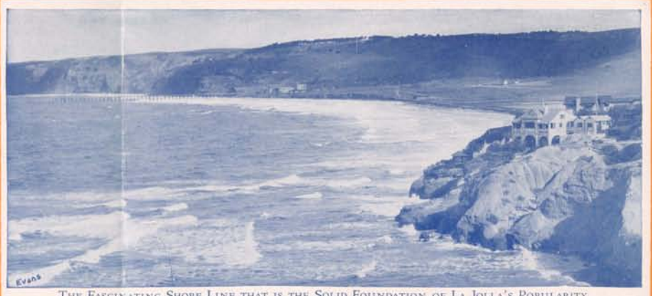
THE FASCINATING SHORE LINE THAT IS THE SOLID FOUNDATION OF LA JOLLA'S POPULARITY