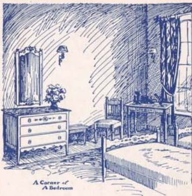
A Corner of A Bedroom

Accommodations may be had single or en suite as desired and with few exceptions all rooms offer a fine view of the ocean and rugged shore.