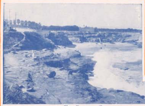
THE BATHING COVE