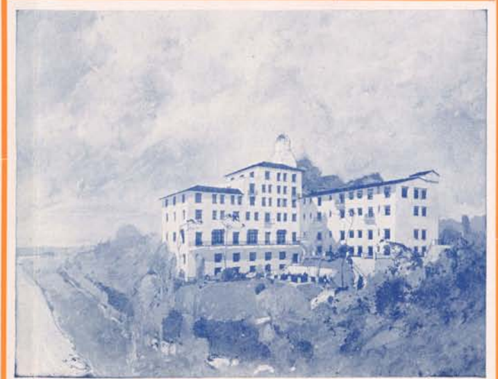
ARCHITECT'S SKETCH. DIGNIFIED SILHOUETTE IS INDEX TO CHARACTER OF INTERIOR