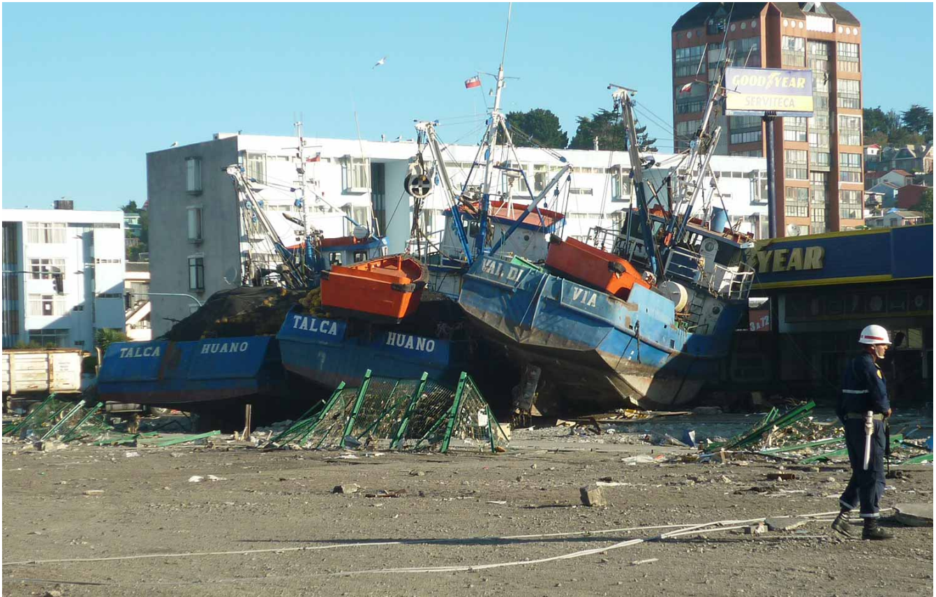
Fishing boats pushed on to land in the city of Talcahuano, Chile by a tsunami, March 2010.