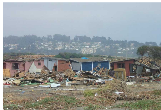
Sepulveda documented the 2010 tsunami's destruction himself in the Chilean town of Llole.

They used the model to look at past tsunamis and found that the leading wave generally has a wavelength so large that any bathymetry errors do little to affect it. Trailing waves, which come minutes or hours later, have shorter wavelengths, placing them on a scale more comparable to the size of bathymetry errors. Those bathymetric features can magnify or attenuate the waves in myriad ways, as can their interaction with normal breaking waves.