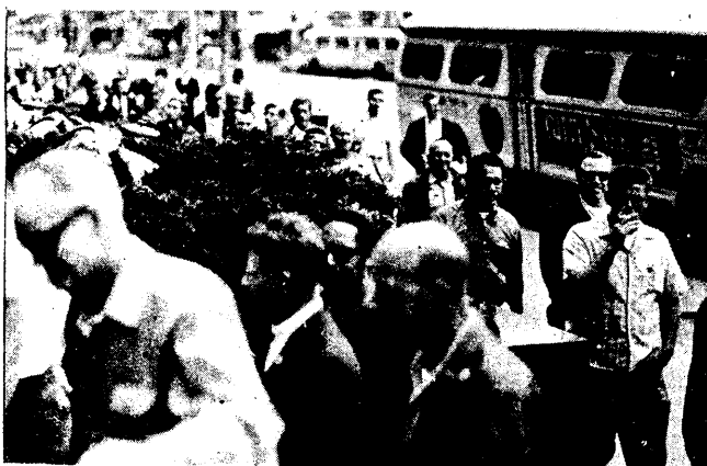
UNION MEMBERS MARCH ON CITY HALL

Picketing went on for a week and a half while the city remained intransigent, and