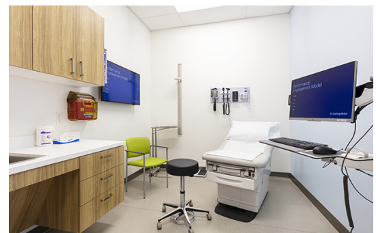
UC San Diego Health clinic in Eastlake located at 2295 Otoy Lakes Road offers express care and imaging capabilities. Primary care available late 2019.