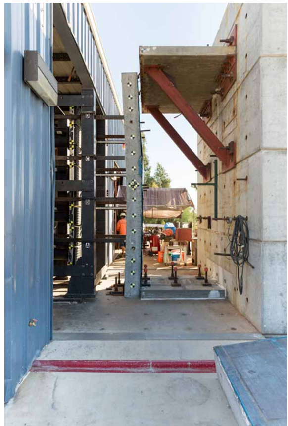
The Extreme Events Simulator is capable of replicating everything from blasts generated by car bombs to damage due to hurricane-force winds

In addition, the center brings together experts in high-end simulation methods, such as finite element analysis, isogeometric analysis and mesh-free modeling. Chen is an expert in the latter. Mesh-free modeling uses points such as pixels in an image as data points for computer simulation. The method is especially adept at simulating blasts because it can track fragments from damaged materials and the impacts they cause. Chen's group has also expanded the use of mesh-free simulation methods to biomechanics, for example, with an investigation of how aging and disorders impact muscle functions, such as muscular dystrophy.