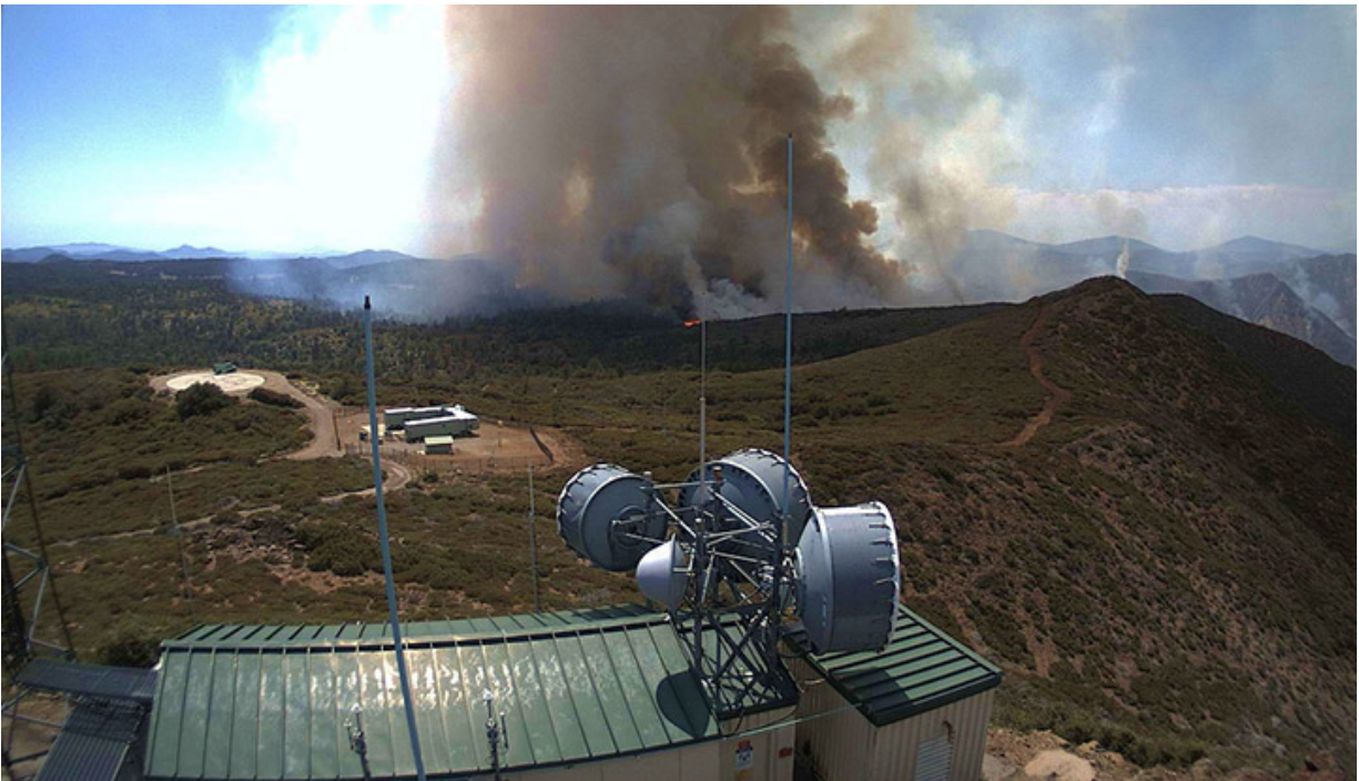
Image of the Chariot Fire on July 8, 2013, which scorched more than 7,000 acres near Mount Laguna, east of San Diego.

NSF-funded project to focus on wildfire predictions and simulations