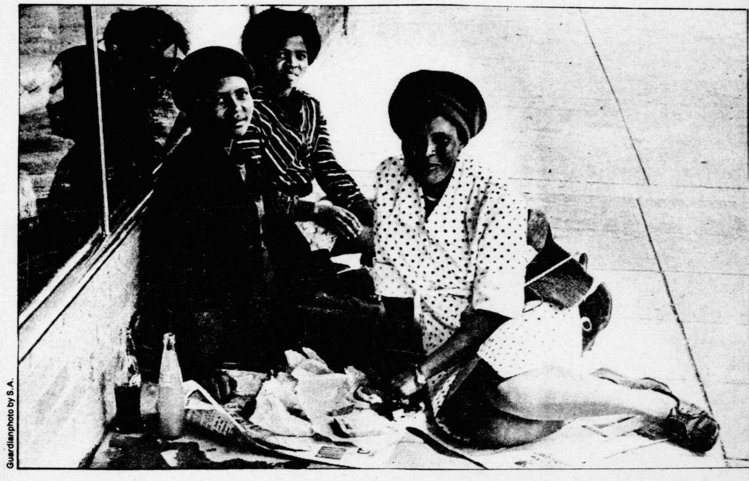
Three South African women who work in the white business district of Mafeking taking their lunch break. Because of the facist system of apartheid, the women are forced to eat their lunch on the sidewalk because they are banned from using park benches and other facilities.

WE MUST ALL FIGHT TO OVERTURN THE BAKKE DECISION!