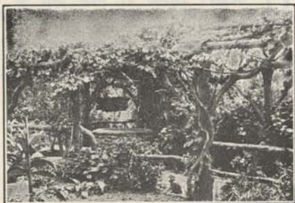
"Wishing Well" at Ramona's Marriage Place