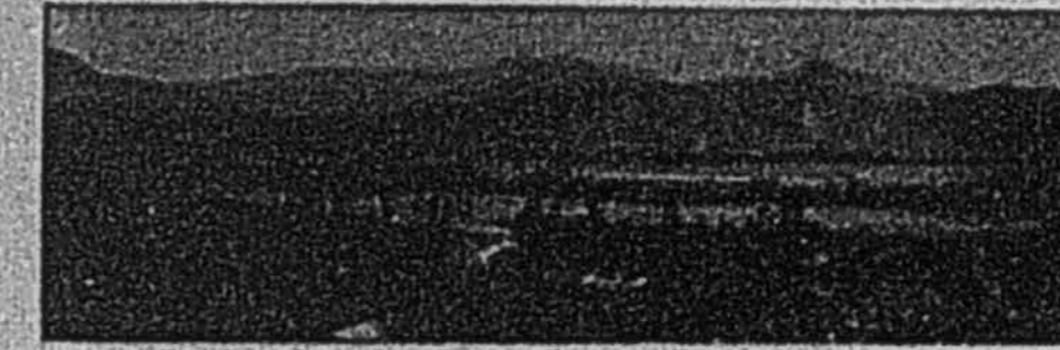
EL CAJON VALLEY, CAL. "A SAN DIEGO INLAND BEAUTY SPOT."