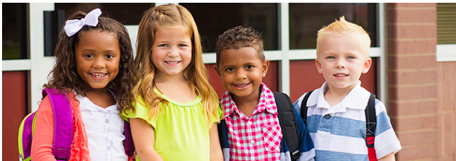
The CDC states that a child's health is the public's health.

She noted, “Our large portfolio of scientific research projects also includes studies of women's health, mental health, global health, access to care, health equity, injury prevention, healthy aging and longevity. Our researchers and physicians use tools from biostatistics/bioinformatics, behavioral medicine, epidemiology, policy, integrative health and dissemination and implementation science.”