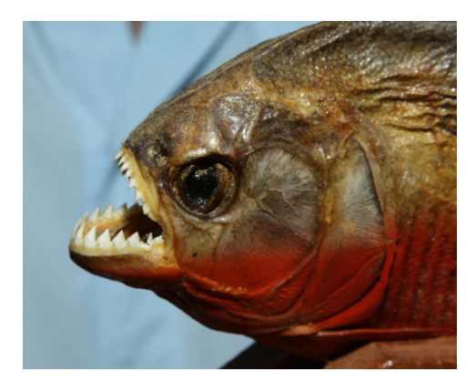
ke teeth of the piranha trap the skin and muscle of its illotine-like bite.

It's a matchup worthy of a late-night cable movie: put a school of starving piranha and a 300-pound fish together, and who comes out the winner?