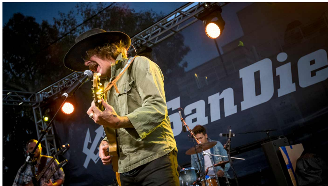
Surfer-songwriter Donavon Frankenreiter performs at the Triton Tailgate.

Fresh from their win at the Sun God Festival's battle of the bands, alumni group Stay for the Fireworks entertained the crowd, followed by headliner, surfer-turned-singer-songwriter Donavon Frankenreiter , whose mellow tunes perfectly fit the sunny SoCal vibe. The grassy field was put to good use with lawn games and a rock climbing wall, as attendees stretched out on fresh Family Weekend beach mats to picnic, visit and enjoy the music.