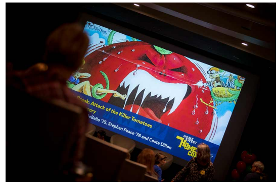
Fun campus trivia kicks off the 40th anniversary screening of the alumni-produced cult classic, Attack of the Killer Tomatoes (1978).