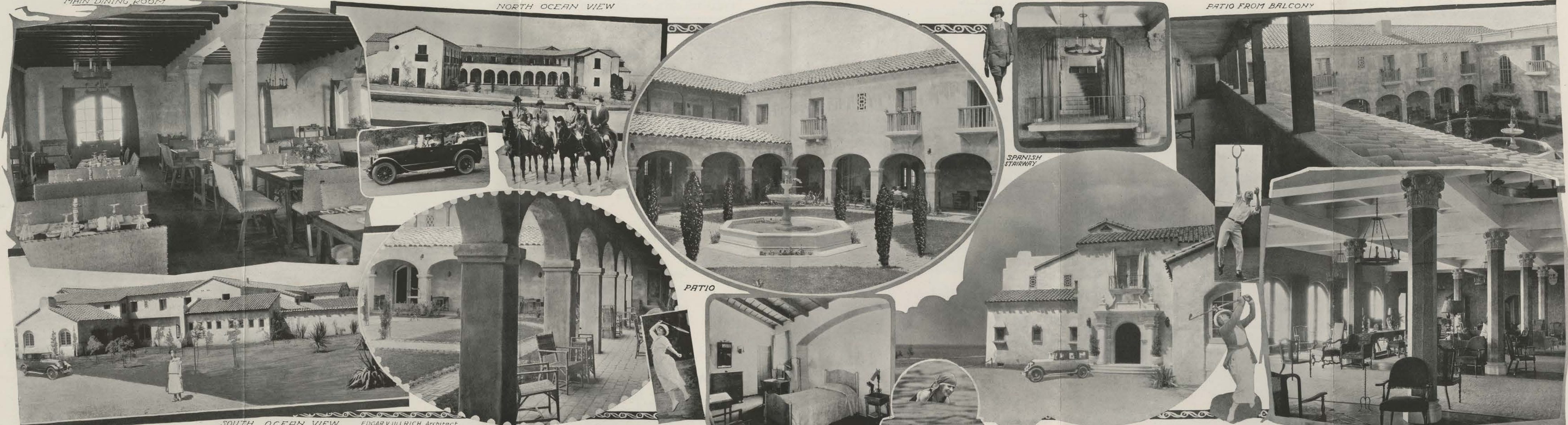
SOUTH OCEAN VIEW EDGAR V. ULLRICH Architect